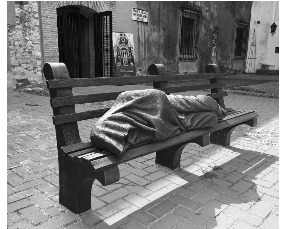
Schmalz, Timothy. Homeless Jesus , from Art in the Christian Tradition, a project of the Vanderbilt Divinity Library, Nashville, TN. https://diglib.library.vanderbilt.edu/act-imagelink.pl?RC=58913 [retrieved June 20, 2022]. Original source: https://commons.wikimedia.org/wiki/File:Homeless_Jesus_CCSD_07_2018_9749.jpg .