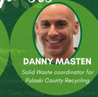
LAKE CUMBERLAND MASTER GARDENERS