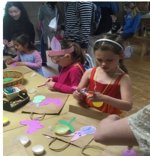
SUCCESSFUL EASTER EGG HUNT, APRIL 13