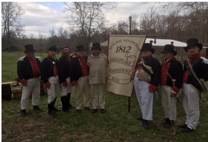
WAR OF 1812 RE-ENACTORS