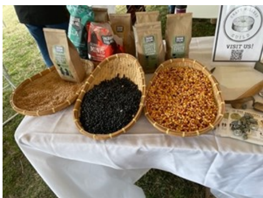
GRAIN PRODUCTS AT THE FAIR

The event was capped off with a tour of an organic farm, a look at Meadow Bakery’s woodfired oven, and a talk on making pasta from whole wheat and other grains. Something for everyone!