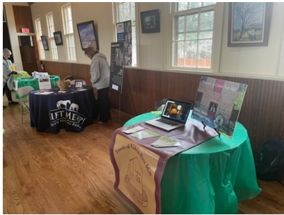
COLVIN RUN DISPLAY

Despite the threat of snow, the event was a great opportunity to network with the local community and answer questions about Colvin Run’s history, grain products, and upcoming events.