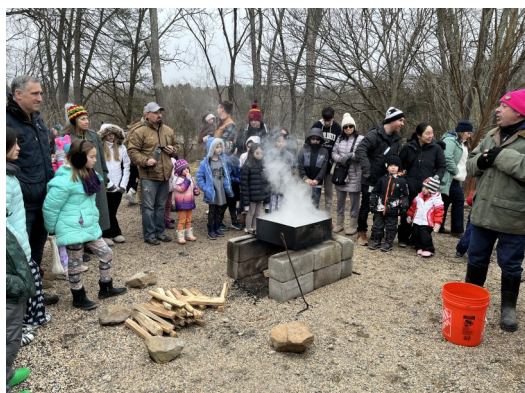
BOILING THE SAP