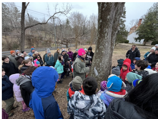
TAPPING A TREE