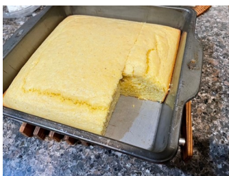
THE CORN BREAD

Blend ½ cup of sifted flour with 1 ½ cups of Colvin Run stone ground corn meal, 1 teaspoon salt, 1 teaspoon sugar and 3 teaspoons baking powder. Beat in three eggs and 1 cup milk; then beat in ¼ cup cream; then beat in 1/3 cup melted butter.