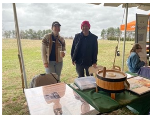
THE COLVIN RUN BOOTH

Visit the Common Grain Alliance stand at Mosaic’s Sunday Farmer’s Market that stock member’s grain products!