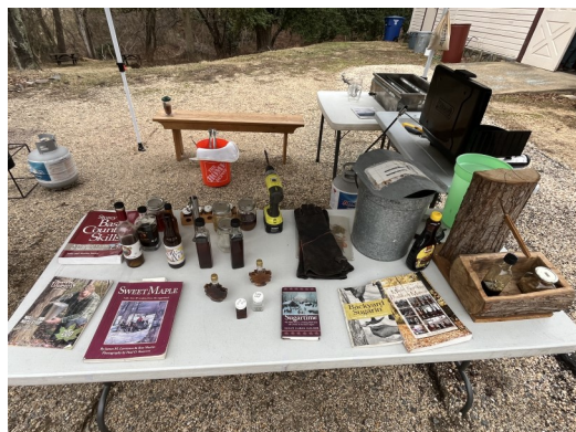
TOOLS OF THE TRADE