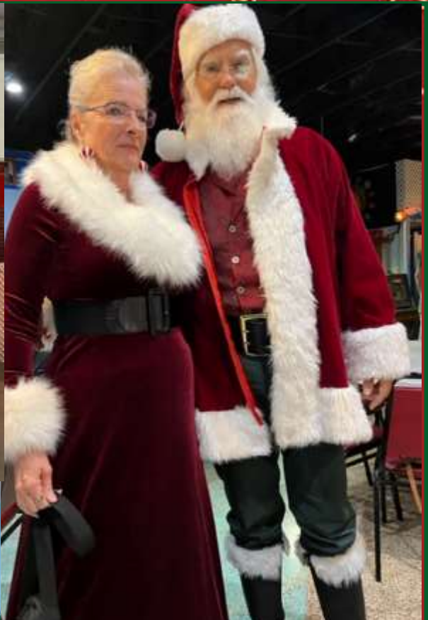
ELK'S MR & MRS SANTA MAKING APPEARANCES AROUND THE ISLAND