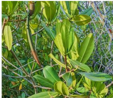
Red Mangroves: " Red, Red – Pointy Head ". In water with shiny pointy leaves, red walking roots & cigar propagules.