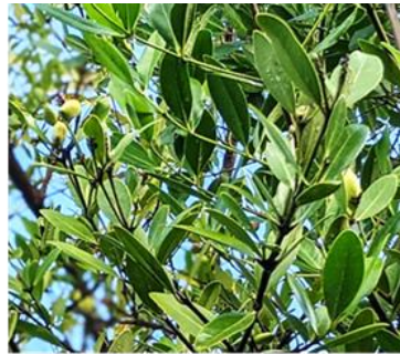
Blank Mangroves: " Black, Black – Lick the Back ". Next to water with gray salt sparkly leaves & black snorkel roots.