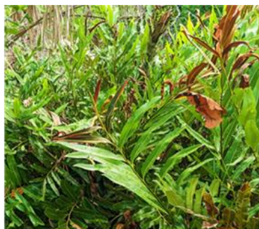
Leather Fern: Big fronds leathery on top & spore "suede" below.