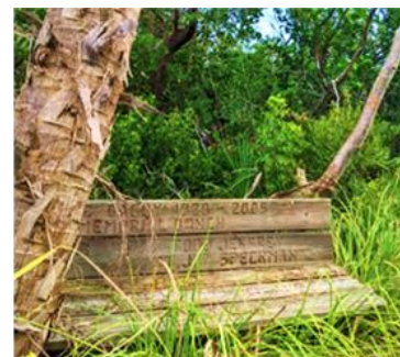
Grounded: Benches floated to treetops by lan back down to earth.