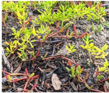
Sea Purslane: A salty succulent that's edible.