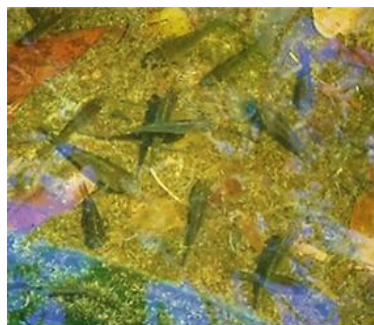
Fish: Mosquito fish hiding, mullet jumping & snook stalking.