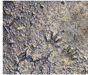
Raccoon Tracks: Walk this way.