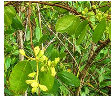
White Mangroves: " White, White – Hold on Tight ". Near water with oval leaves with nodules at base & notch at tip.