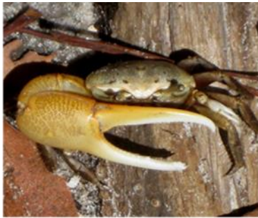
Fiddler Crabs: Boys tend house & girls get food.