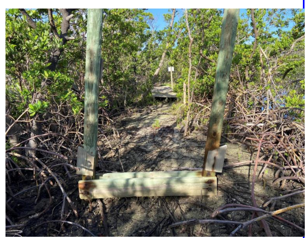
The start of the former boardwalk, post Hurricane Ian.