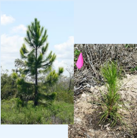
Slash Pines near St. Jude Trail.

Hobbies/ Interests include hiking, canoeing, sailing and photography. He is a long term supporter of Nature Conservancy, Calusa Land Trust and the Pine island Plan.