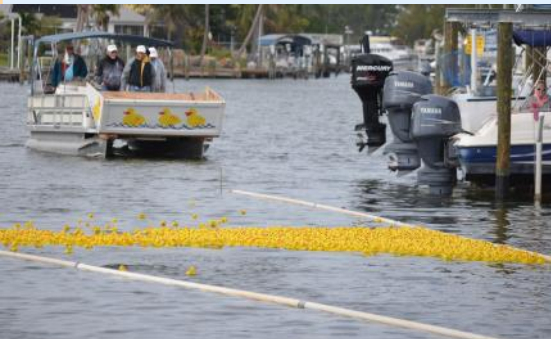
They're off and paddling