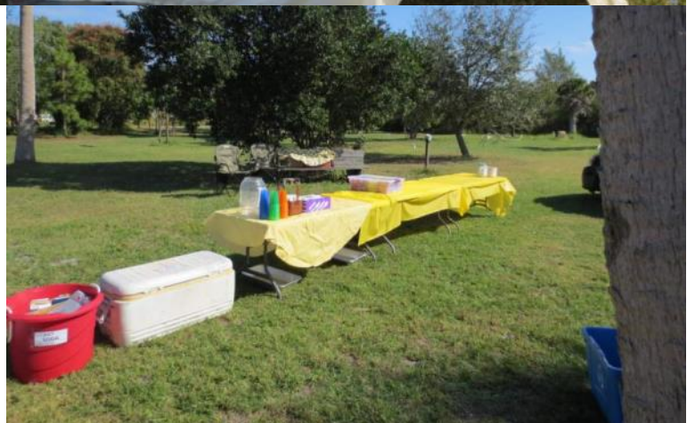
Scenes from our 2013 Annual Meeting