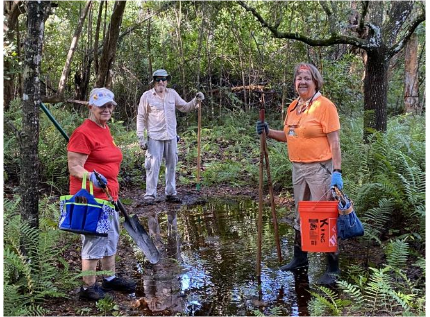
Hearty volunteers at Taylor Willow Preserve

The season is here so come out and join us, we are ready to go!