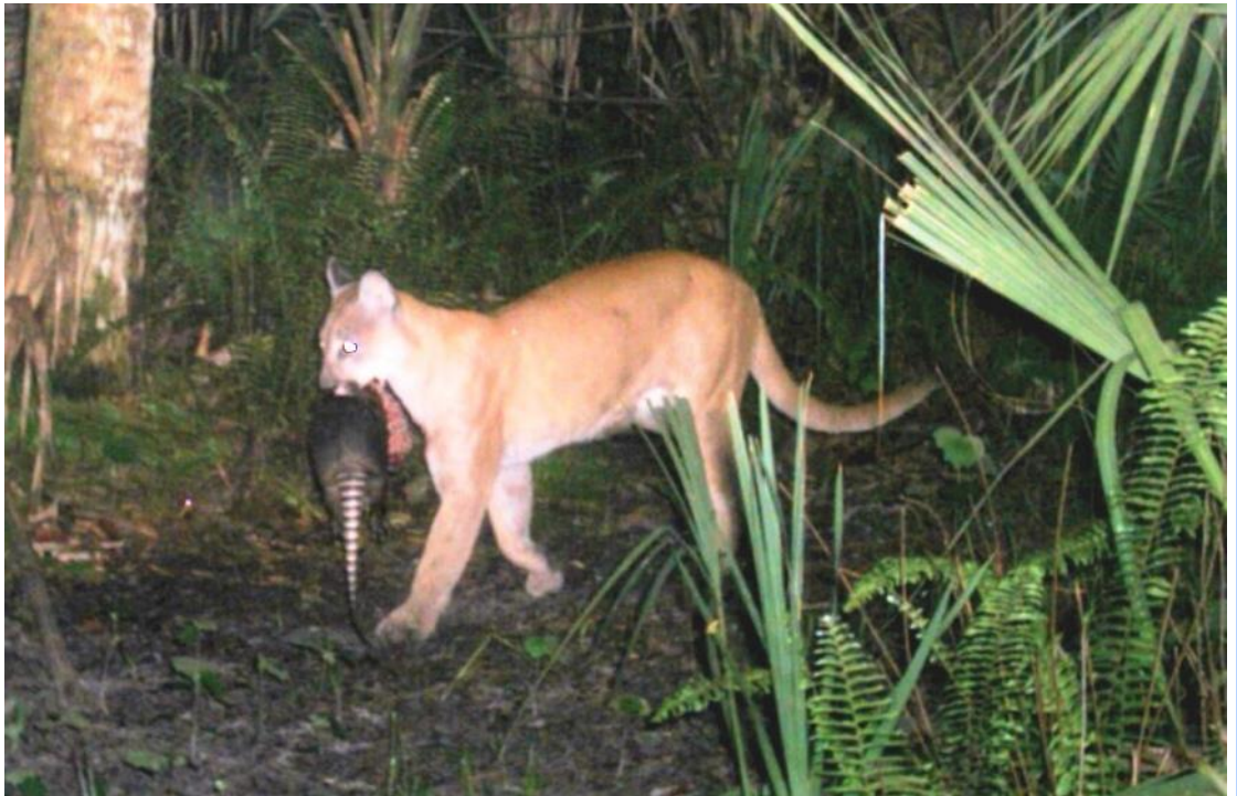
Florida Panther with dinner :“on the Half Shell”.

The average armadillo measures two to four feet long and weighs eight to eighteen pounds. Their life expectancy in the wild is seven to ten years, but upwards to twenty years in captivity. Their home burrows are about eight inches wide and up to fifteen feet deep. Our Pine Island armadillos are native and shared this island with the island's original inhabitants, the Calusa Indians.