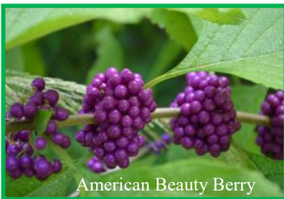
American Beauty Berry