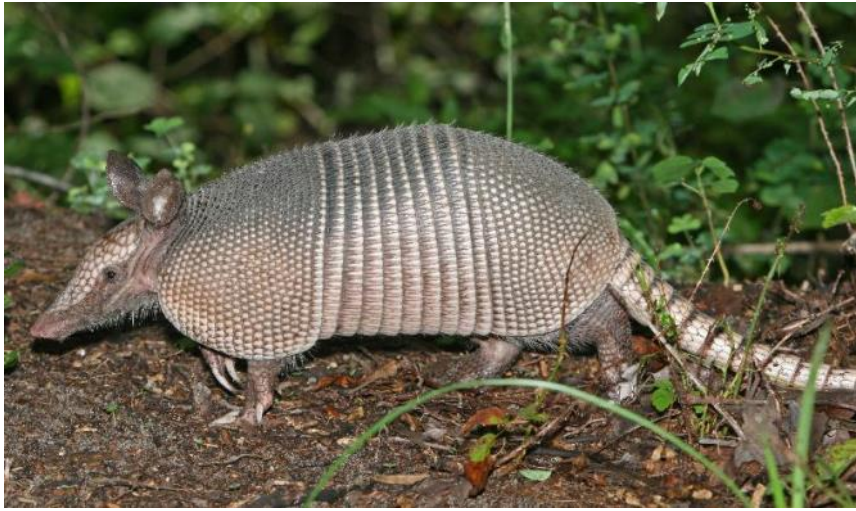
Adult nine-banded armadillo; notice large claws and ears.

Armadillos (“little armored ones” in Spanish) are mammals and give birth to four identical babies from one egg. Gestation in our nine-banded type is eight months. The young are born with soft, leathery skin which hardens within a few weeks. They become independent from six to twelve months from their births. Although their undersides are soft and furry, the armor-like skin is their main defense system, since they roll up in a ball for protection when provoked. These creatures possess long, sharp claws for burrow digging and for night time dining on grubs (a favorite), snails, larvae, beetles, cockroaches, grasshoppers, ants and termites. Their mouths contain no molars or canines, but rather numerous cheek teeth. When startled they will jump some three to four feet into the air, which can cause mortal contact with the under bottoms of motor vehicles. Swimming is a major skill with the abilities to walk on the bottom (breath holding for up to six minutes) or traversing deeper waters by swallowing air so their stomachs and intestines can serve as buoyancy ballast.