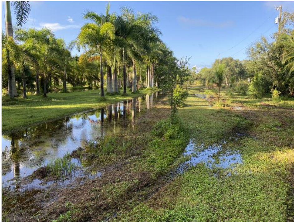
The entrance to Taylor Willow Preserve - Under- water