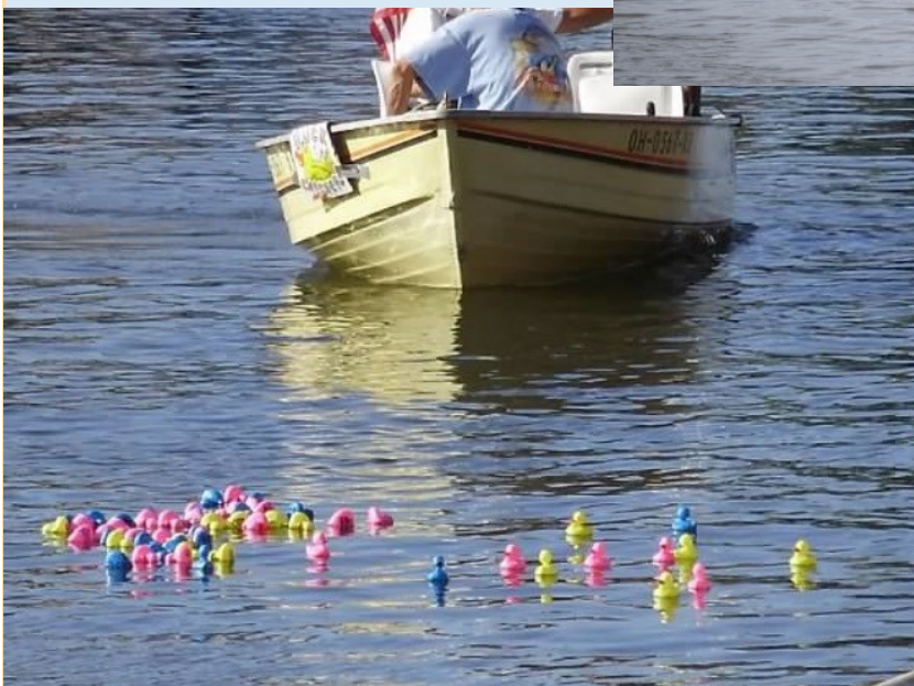
The Lucky Ducks racing.