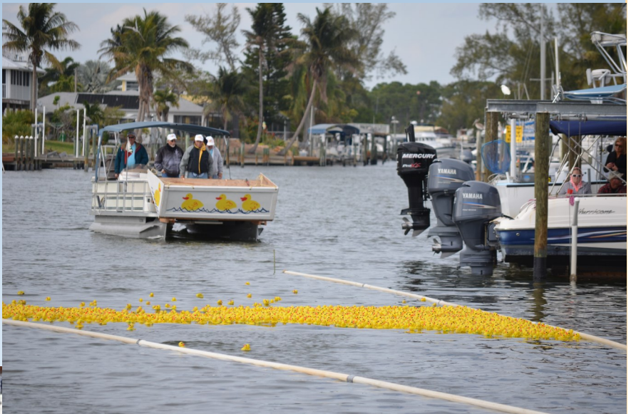
They are half way home!