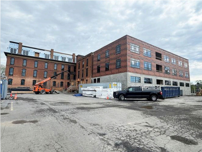
A look at the work being done on the Huntington Building in Seneca Falls from the canal side of the property.

SENECA FALLS — It was a project that almost didn't happen.