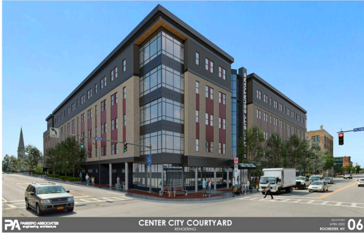
Center City Courtyard rendering shows the completed project. (Rendering provided by CSD Housing, LLC)

Home (/) > Today's Top Stories (https://Rbj.Net/Category/Todays-Top-Stories/) > Rochester's Center City Courtyard: From parking lot to 5-story affordable housing