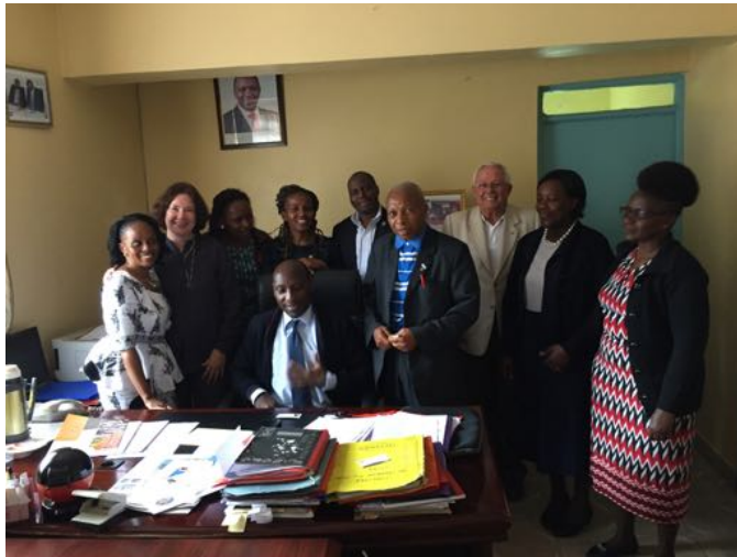
At the Embu Ministry of Health with the Executive Health Committee Officers, Embu Rotarians, and Meru Rotarians