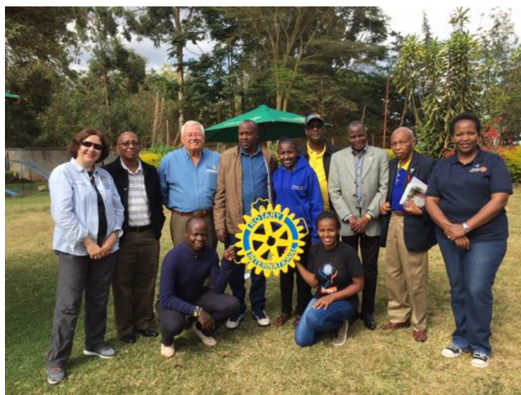
Planning meeting in Meru with Mt. Kenya Area Rotarians

After compiling a report that outlined the various activities that can be components of a comprehensive Cervical Cancer Prevention Project, HEWRAG leaders presented a summary of how those project components fit within the conditions found in Kenya. Through a discussion facilitated by HEWRAG, local Rotarians began the process of developing a project that fits the specific needs of the communities served. At the conclusion of the planning session, the Mt. Kenya Area Rotarians had outlined a path forward in their planning process.