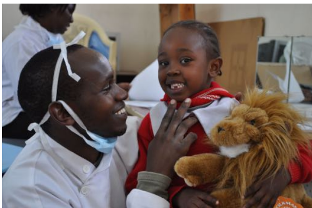
This child just had her teeth cleaned for the first time