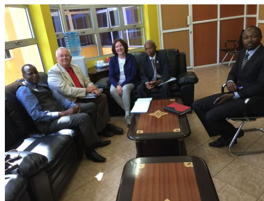
At the Meru County Ministry of Health with the County Cancer Coordinator and Meru Rotarians