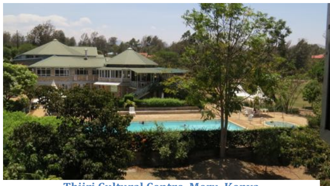
Thiiri Cultural Centre, Meru, Kenya