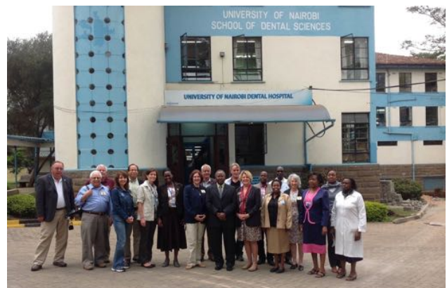
The US and Kenya Vocational Training Teams in Nairobi