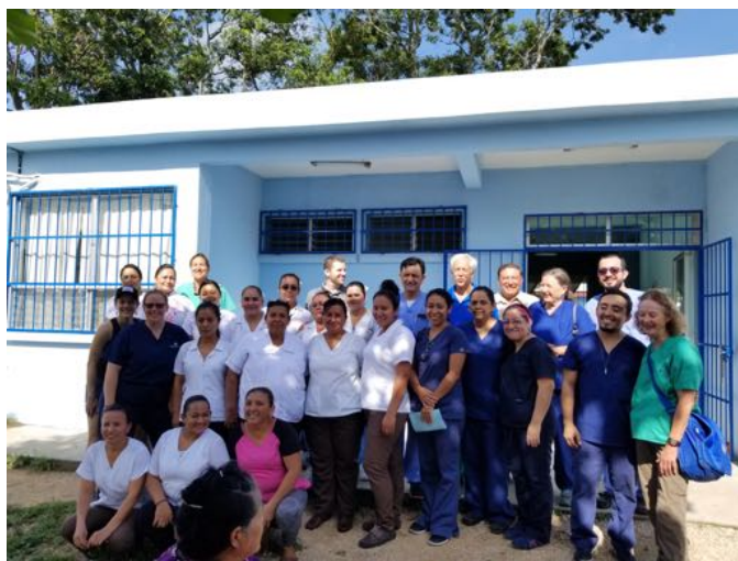
The PINCC Team and Hospital San Benito Support Staff

VIA requires only a strong headlamp, acetic acid solution, and a speculum in order to identify the HPV virus and the occasional malignant changes the human papilloma virus causes. We saw an approximate 6% positive rate for the virus with most diagnoses in the CIN1 category (cervical intraepithelial neoplasia), a pre-malignant development. This condition was treated with thermocoagulation on inspection, rendering it non-invasive. One malignant diagnosis was made, and the patient will be referred to the Government hospital in Guatemala City. All data were analyzed and added to PINCC's database.