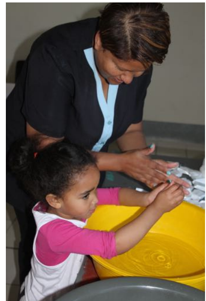
A child learning to wash her hands