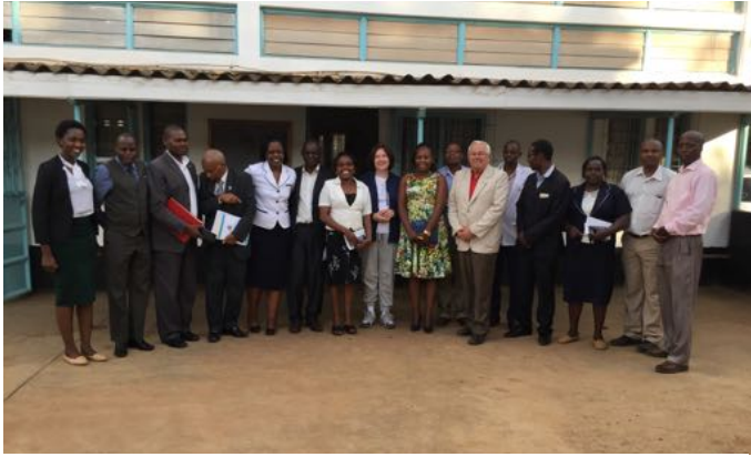
At the Tharaka-Nithi County Hospital with the medical staff, officials with the Ministry of Health, and Meru Rotarians