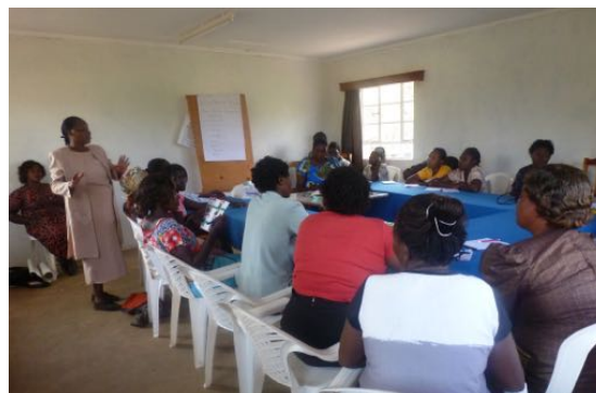
A class lesson on nutrition education

The Food Science staff at Meru University of Science and Technology helped to write a curriculum and to train eight local women who were fluent in both the vernacular and English. These trainers were mothers selected from two local primary schools and by community leaders. They were empowered to train about 550 mothers in groups of 50. Each week-long course was conducted over 5 days with sessions of 7 hours per day for a total of 35 class hours.