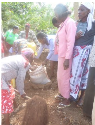
Practical gardening experiences

The program, delivered in the local language of Ki-Meru, addressed topics of good nutrition including effective gardening practices and how to prepare and enjoy nutritious meals cooked on their own locally manufactured Jiko energy efficient stoves (that they helped to buy at a significantly reduced price).