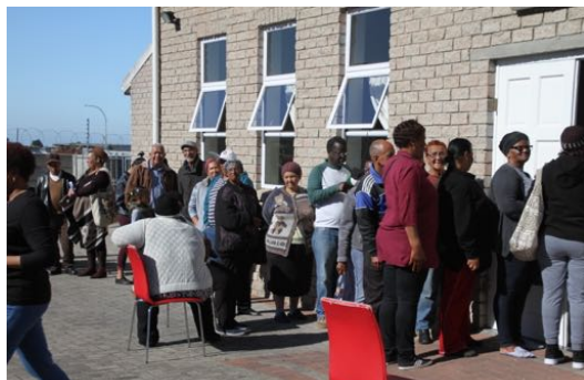
Clients lining up for services

For more information, please contact Josie Norfolk at josie@beachroad.co.za