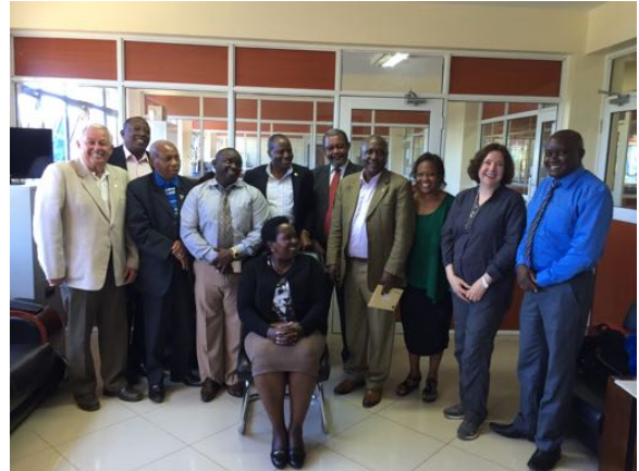
At the Kirinyaga County Ministry of Health with Officers of the County Executive Committee of Health, members of the Rotary Club of Kirinyaga and the Rotary Club of Meru