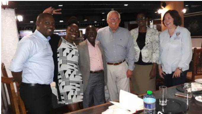
Reunion in Nairobi with the Kenya Smiles VTT dentists