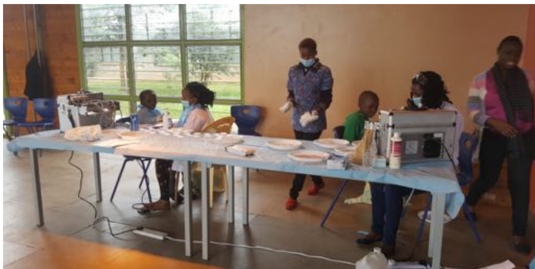
In July-August 2018 at Kaptembwa Primary School in Nakuru, the Kenya Dental Association screened 714 students and used the mobile operators for those who needed treatment