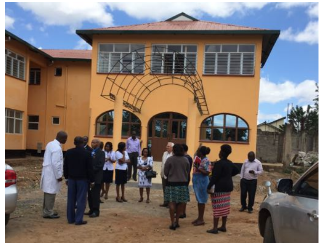
At the new Embu Cancer Hospital