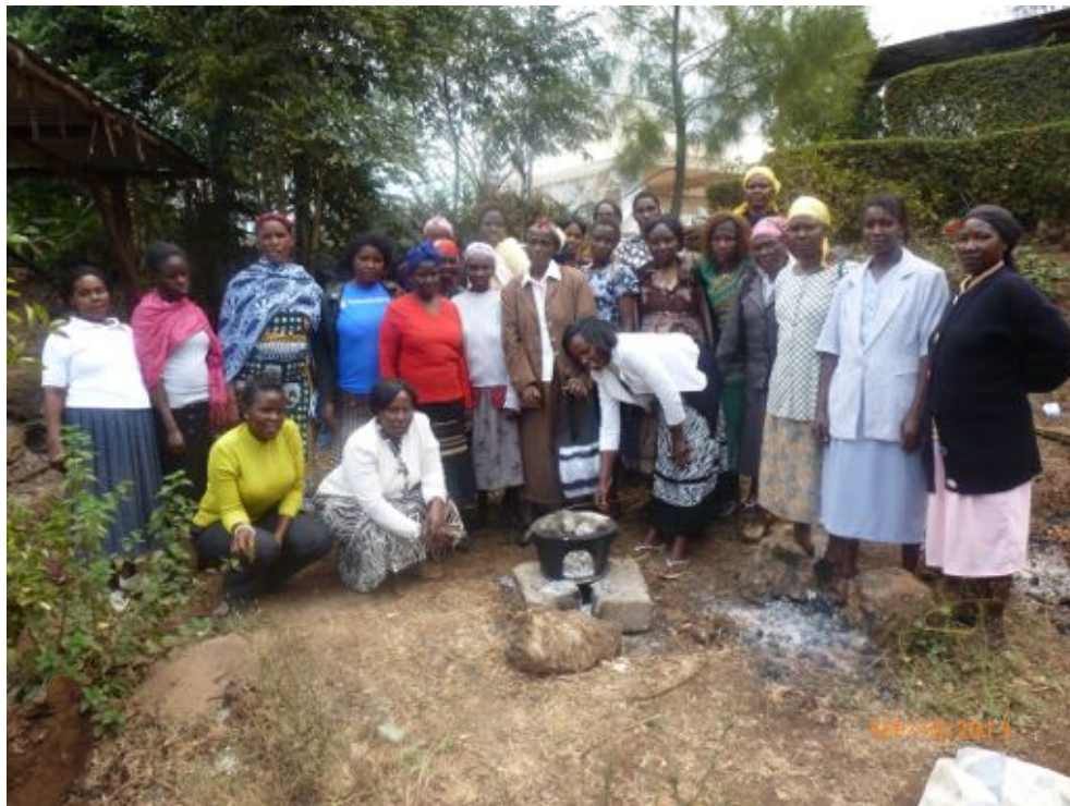
Hundreds of program graduates learned new ways of preparing nutritious foods on their own locally manufactured energy efficient jiko stoves

For more information please visit our website: http://www.thiiri.co.ke/thiiriholdings , or email me at thiiri.marilyn@gmail.com