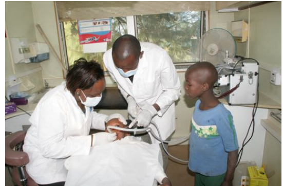
A young boy watches KDA dentists use a mobile operator to treat his brother