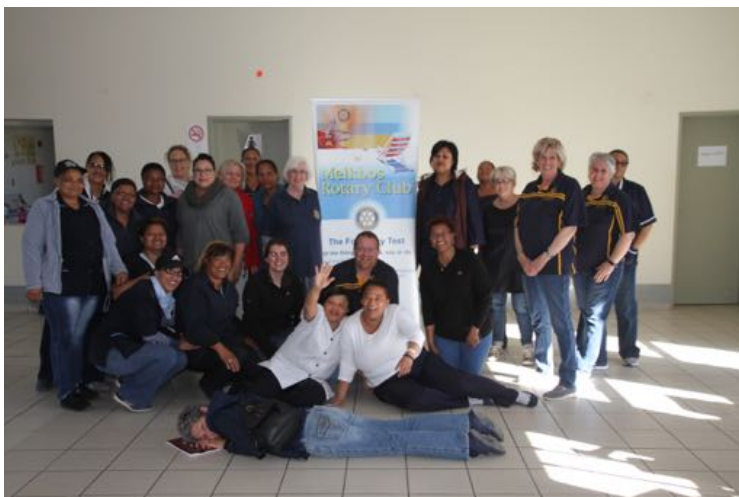
Melkbos Rotarians on Eye Health Day, October 3, 2018