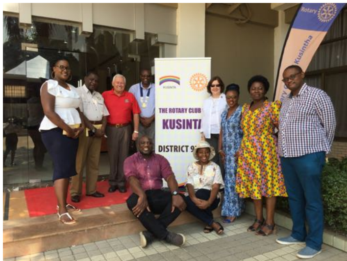
With members of the Rotary Club of Kusinta in Lusaka

Overall, our time in Africa was well spent, and we left with a great deal of pride in Rotary and its worldwide network of Rotarians dedicated to improving health worldwide.