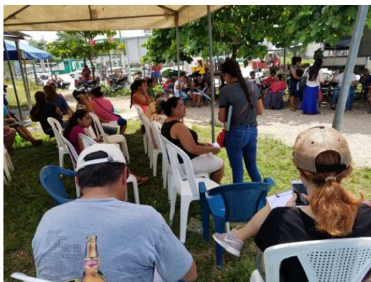
The outdoor waiting room of Hospital San Benito