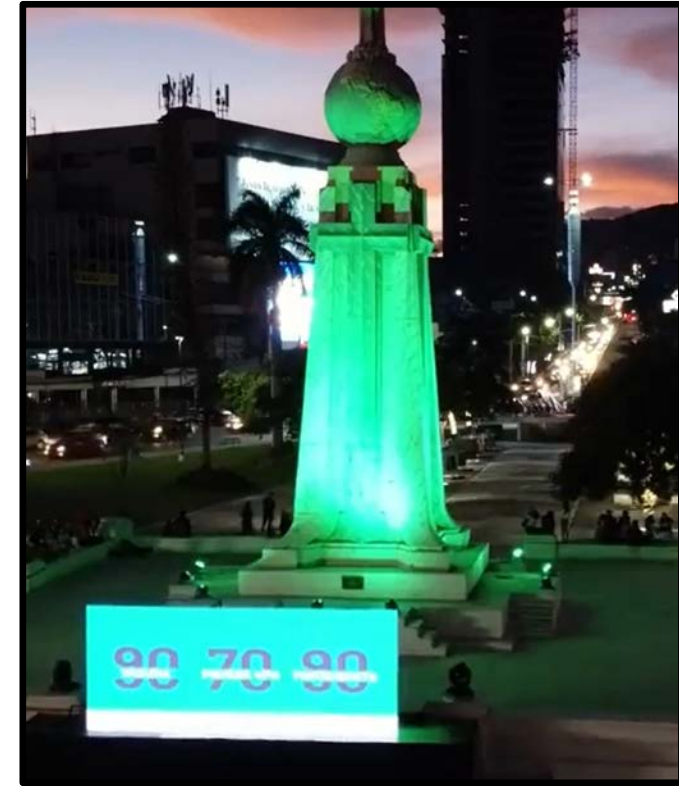
El Salvador: lighting of Monumento al Divino Salvador