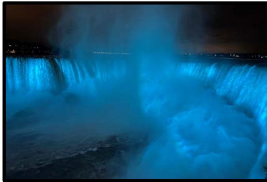
Canada: Niagara Falls illuminated in teal

For the first time ever, 194 countries have resolved to eliminate a cancer: cervical cancer.