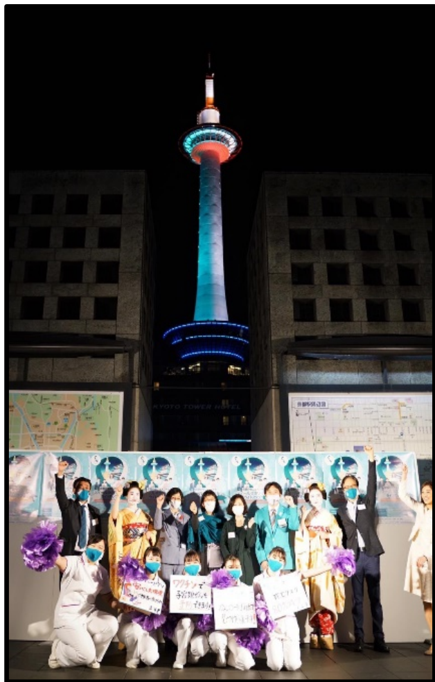
Japan: civil society celebrates under the teal-lit Kyoto tower.

This November 17, another international day of action will mark one year of the movement!