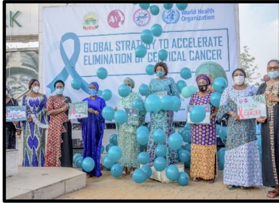
Nigeria: First Ladies unite to celebrate the launch and advocate for elimination