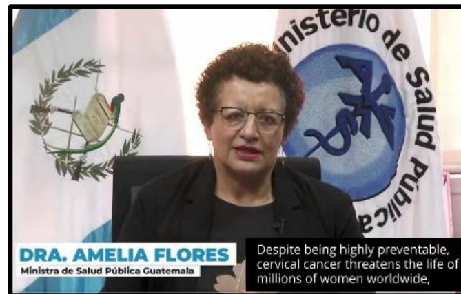
Guatemala: minister of health pledges commitment to eliminate cervical cancer