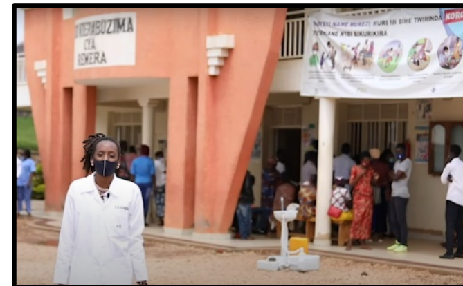
Rwanda: MOH launches cervical cancer services on Nov 17 at health facilities

Or contact us through the website: https://www.who.int/initiatives/cervical-cancer-elimination-initiative