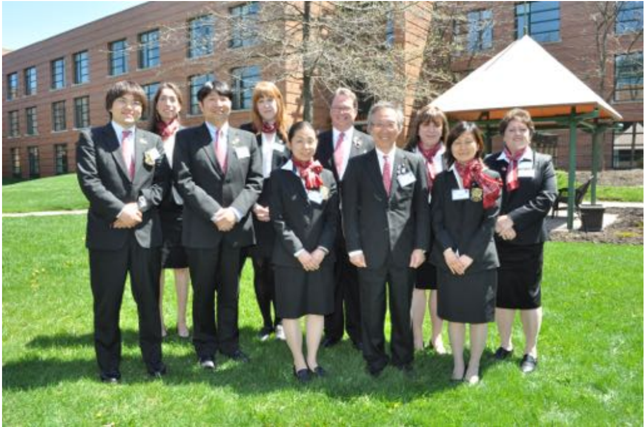
Vocational Training Teams from Canada and Japan, May 2013