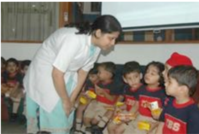
DHAS offers dental health awareness at traveling dental exhibitions.

All activities, equipment, and materials are sponsored by the Trigon Dental Society. Free services are offered by the volunteer dentists from the near by dental colleges. No charges are taken for any services rendered by the society.