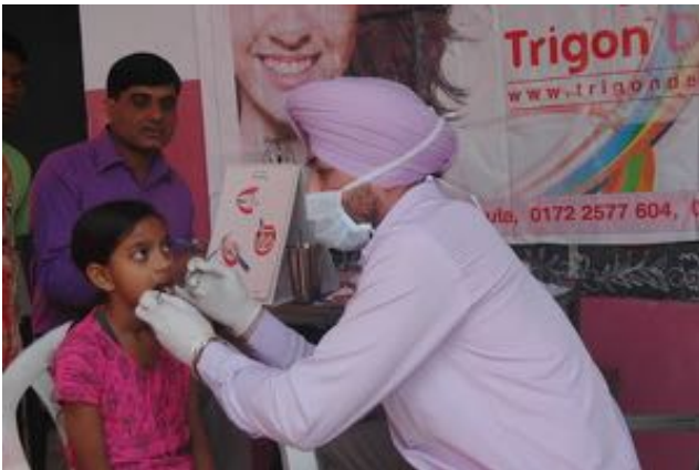
DHAS dentist provides a dental examination for a child.

We have been pioneers in introducing innovative programs every year to make the whole project effective and sustainable. Some of the major projects undertaken are: