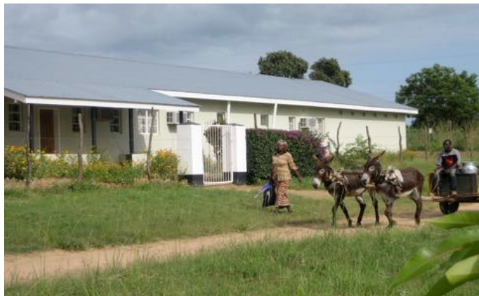
The IVV Guest House in Zimba, Zambia.

To that end we have sent many eye teams to Zimba, Zambia since 1994. These eye teams have donated time, skills, and equipment to provide the latest eye care and surgery to the poor and needy.