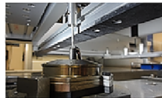
Wave Height Control