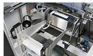
Solder pot trolley system