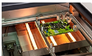
High performance preheat