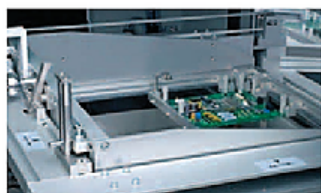
Universal PCB carrier