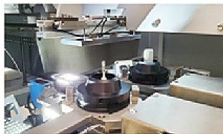
Quick Change Nozzles