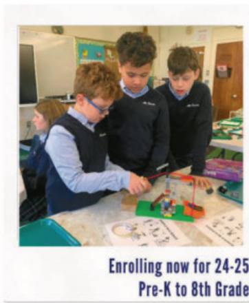
Enrolling now for 24-25 Pre-K to 8th Grade

139 West Rocks Road Norwalk allsaints.norwalk.com