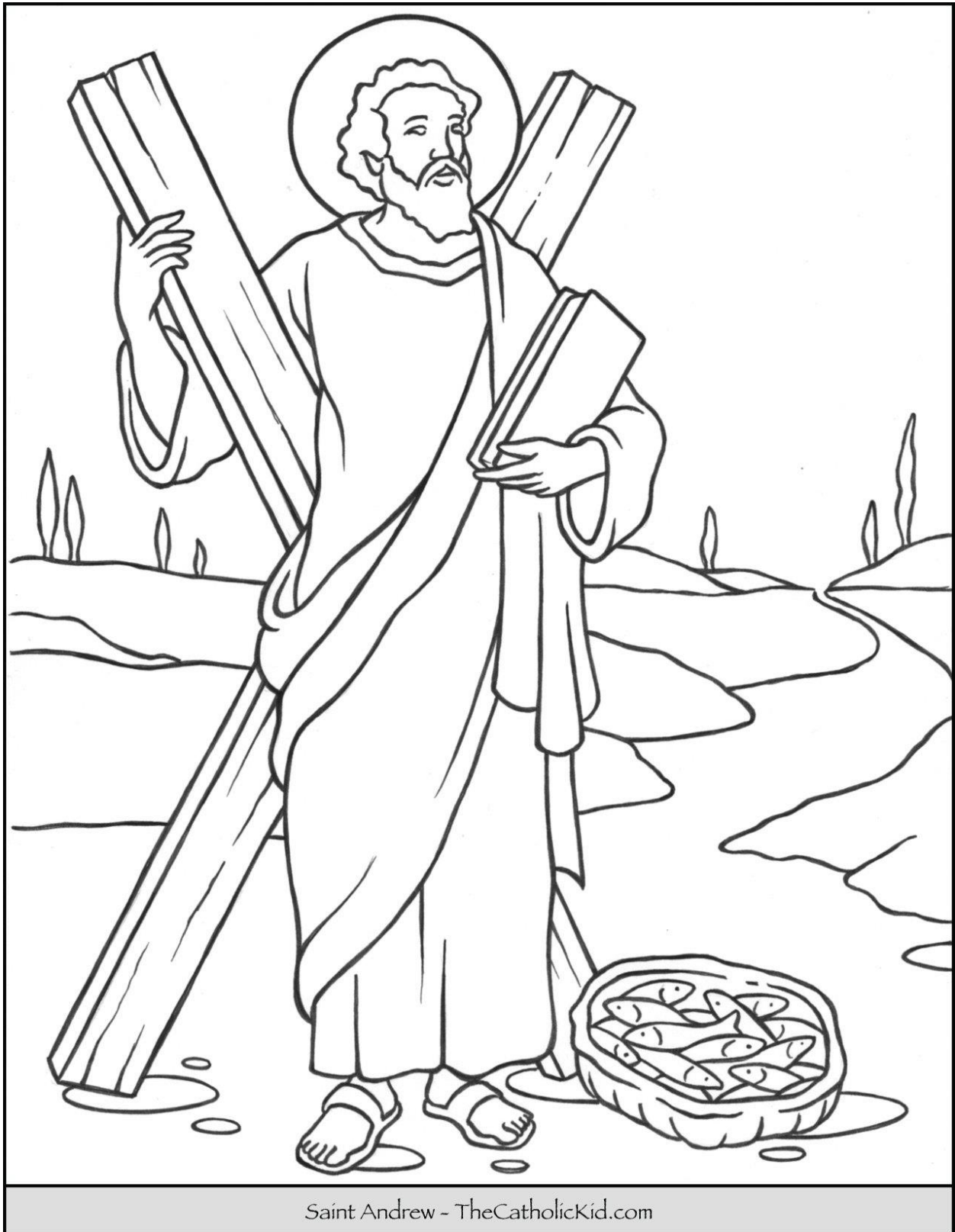
Saint Andrew - TheCatholicKid.com

Brought to you by CatholicMom.com and Holy Cross Family Ministries. THE FAMILY THAT PRAYS TOGETHER STAYS TOGETHER.