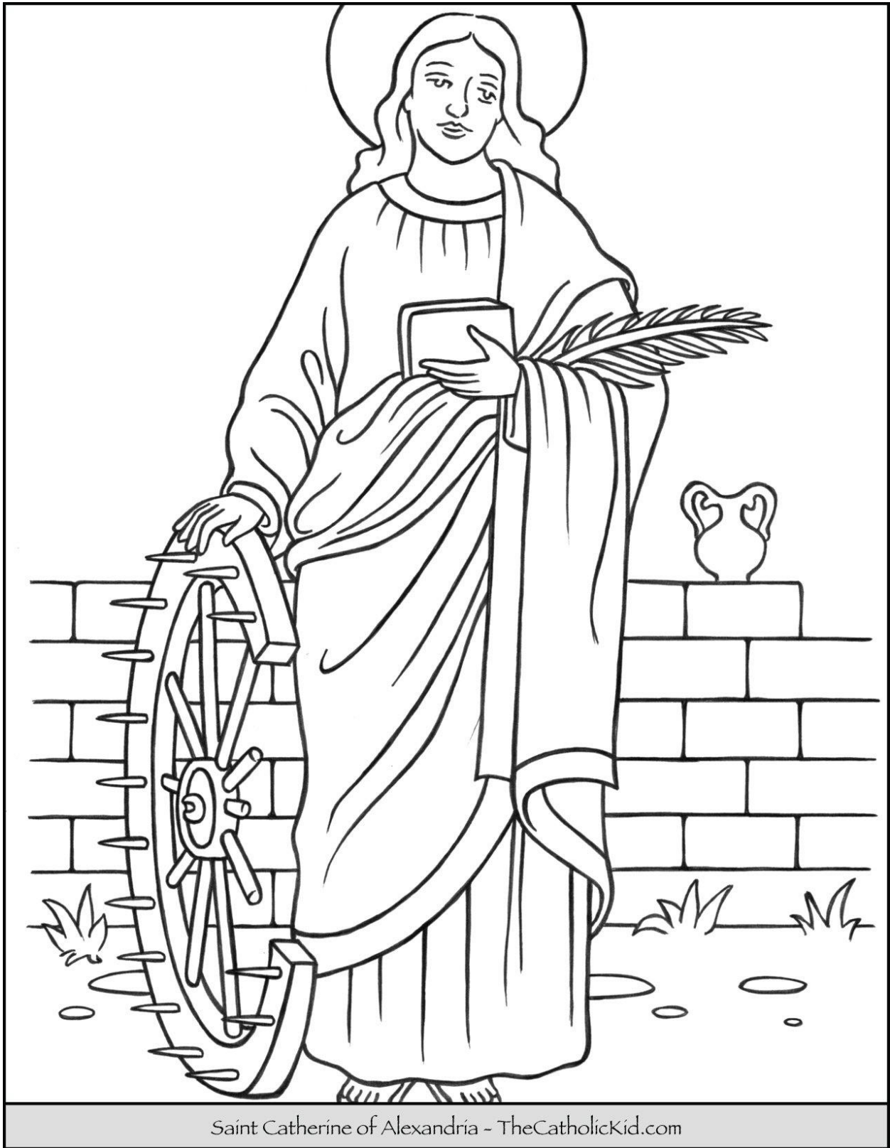
Saint Catherine of Alexandria - TheCatholicKid.com

Brought to you by CatholicMom.com and Holy Cross Family Ministries. THE FAMILY THAT PRAYS TOGETHER STAYS TOGETHER.