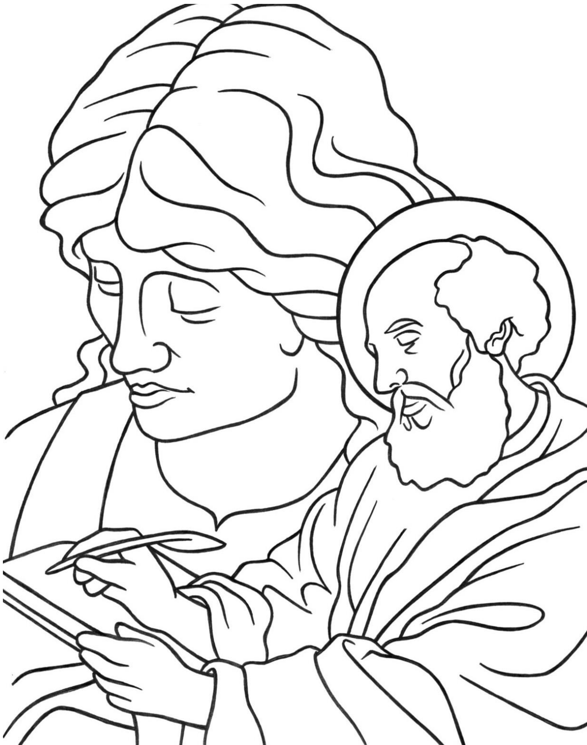
Saint Matthew