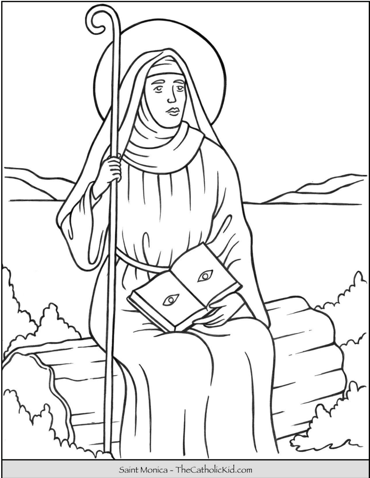
Saint Monica - TheCatholicKid.com

Brought to you by CatholicMom.com and Holy Cross Family Ministries. THE FAMILY THAT PRAYS TOGETHER STAYS TOGETHER.