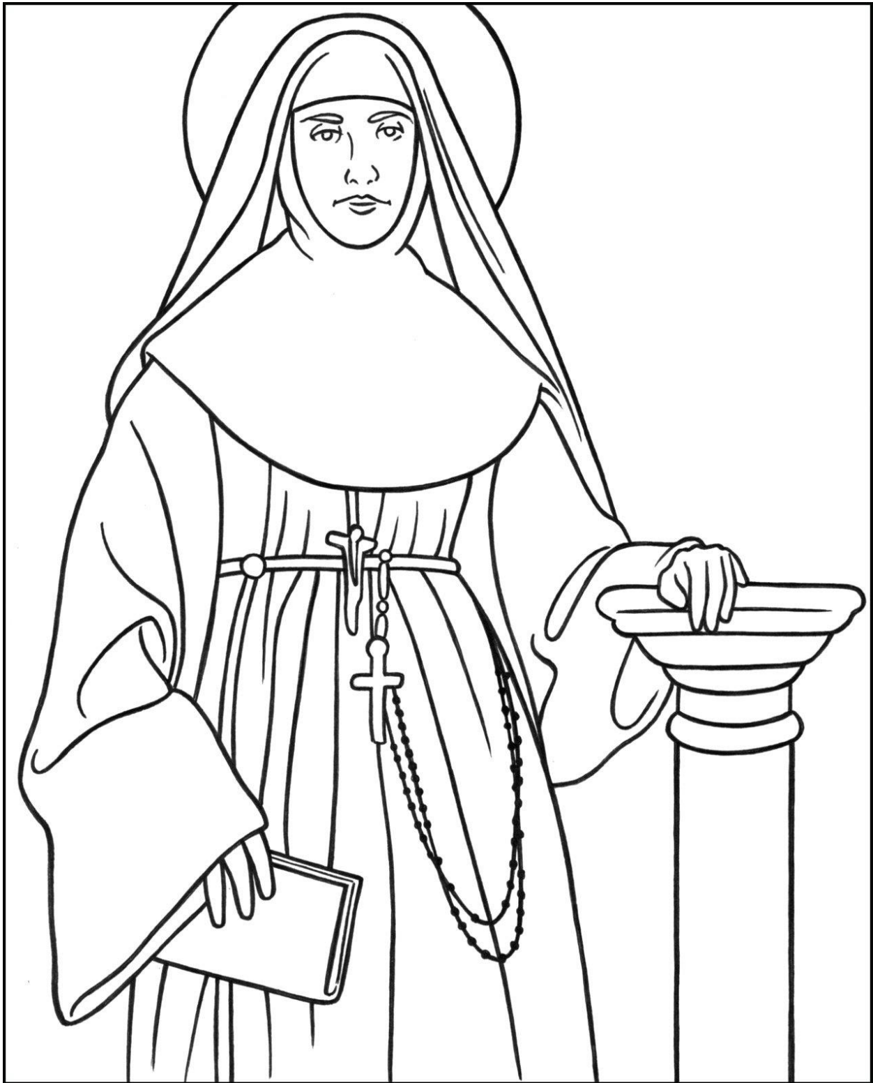
Saint Marianne Cope

Brought to you by CatholicMom.com and Holy Cross Family Ministries. THE FAMILY THAT PRAYS TOGETHER STAYS TOGETHER.