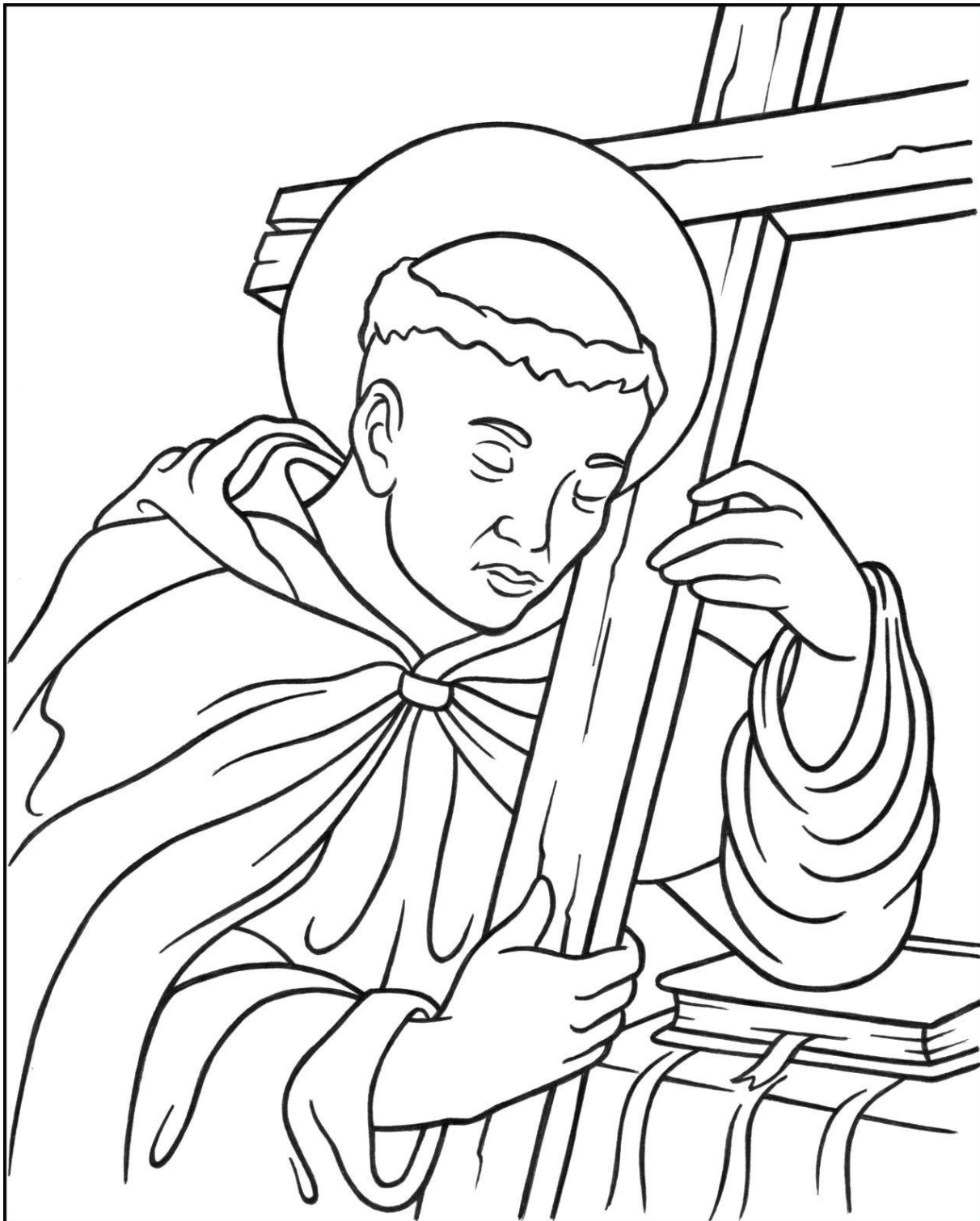
Saint John Joseph of the Cross