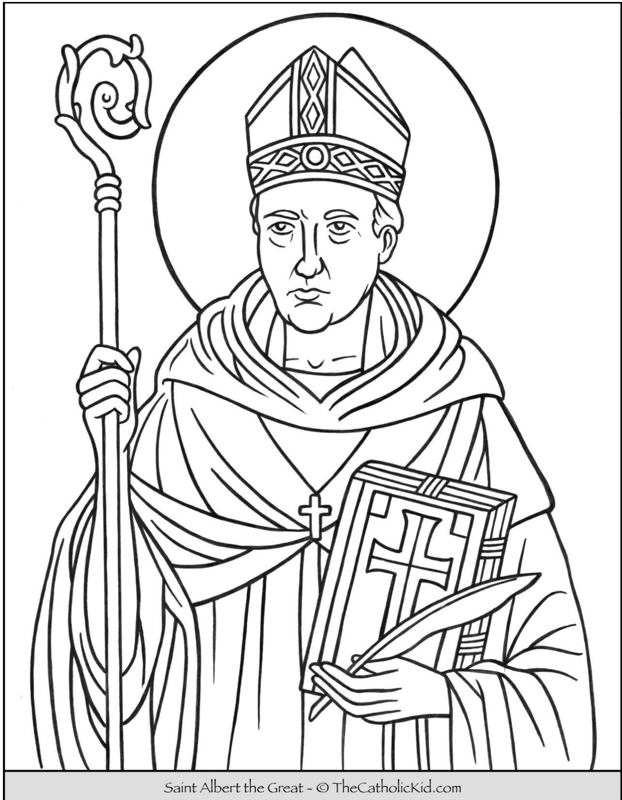
Saint Albert the Great

Brought to you by CatholicMom.com and Holy Cross Family Ministries. THE FAMILY THAT PRAYS TOGETHER STAYS TOGETHER.