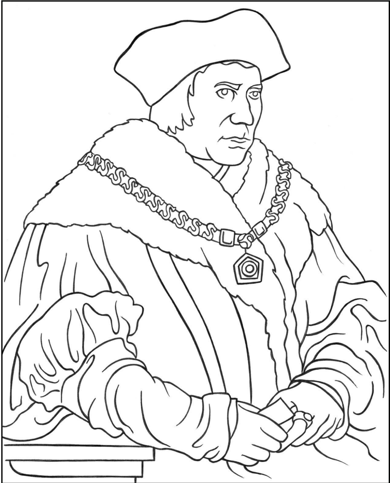
Saint Thomas More