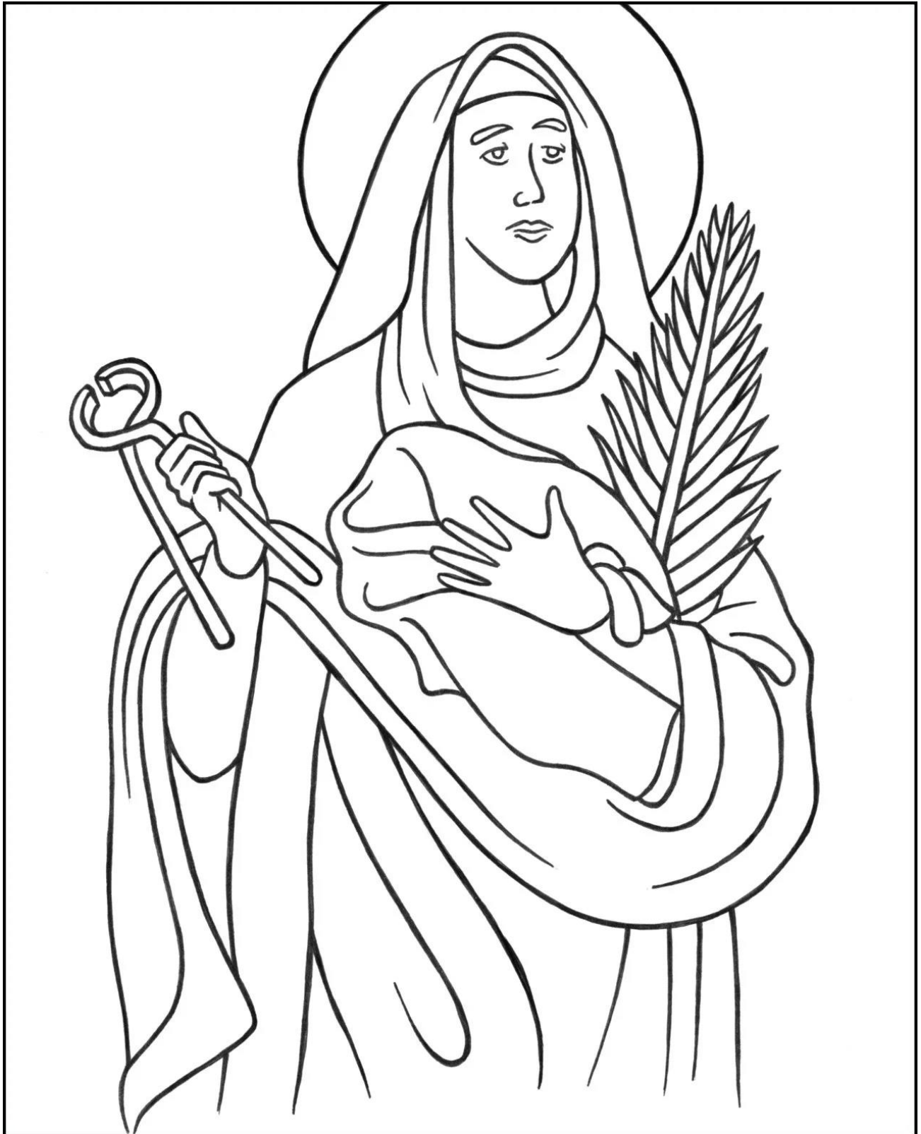
Saint Agatha - TheCatholicKid.com