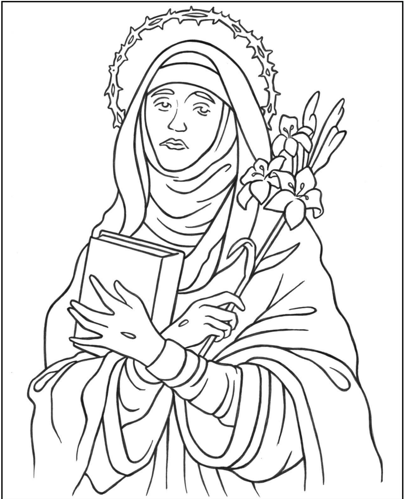
Saint Catherine of Siena - TheCatholicKid.com

Brought to you by CatholicMom.com and Holy Cross Family Ministries. THE FAMILY THAT PRAYS TOGETHER STAYS TOGETHER.