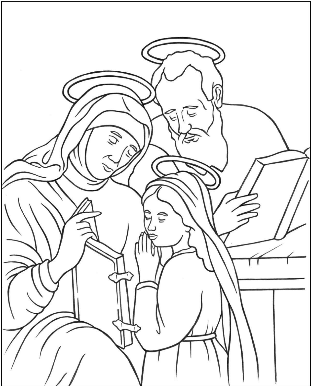
Saint Joachim, Saint Anne & Saint Mary

Brought to you by CatholicMom.com and Holy Cross Family Ministries. THE FAMILY THAT PRAYS TOGETHER STAYS TOGETHER.