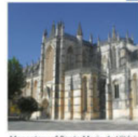
Monastery of Santa Maria da Vitória, Batalha, Portugal