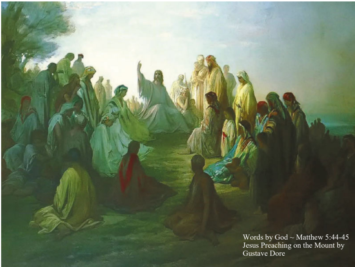
Words by God ~ Matthew 5:44-45 Jesus Preaching on the Mount by Gustave Dore

February 19, 2023 Seventh Sunday in Ordinary Time