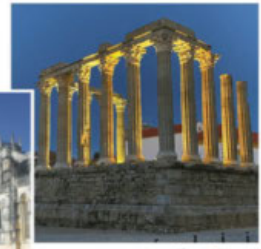
Évora, Portugal, a UNESCO World Heritage Site

Pilgrimage Price: $3,400 per person double or triple