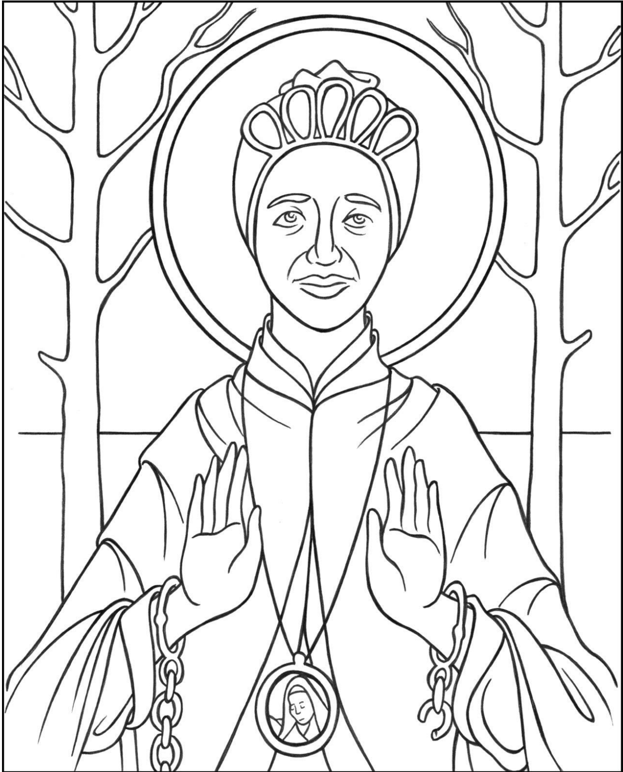
Saint Josephine Bakhita

Brought to you by CatholicMom.com and Holy Cross Family Ministries. THE FAMILY THAT PRAYS TOGETHER STAYS TOGETHER.