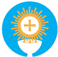
St. Thomas the Apostle Catholic Formation • Norwalk, CT

ATTENTION ALL STUDENTS ENTERING 6 th , 7 th , & 8 th GRADES THIS FALL Friends, This summer you will hear from us about a NEW PROGRAM sponsored by 4 Norwalk Parishes: St. Thomas, St. Philip, St. Jerome, and St. Matthew, that will begin this Fall. It will be a Co-Op to gather together our Junior High School (grades 6, 7 and 8) students at our own All Saints School on Sunday afternoons or possibly evenings to form a follow up of Post-Confirmation activities, education, prayer, and fun for our students of both Catholic Schools and Religious Education Programs. After many fruitful sessions with the Bishop and his office staff, the four local Norwalk pastors got together and formed a plan that, hopefully, will be attractive to your children and to you as parents. We hope you see the validity and importance of encouraging your children to be a part of this new program. I am so looking forward to our first meeting in the fall, and until then, please check our social media and our parish bulletin for more details about it.