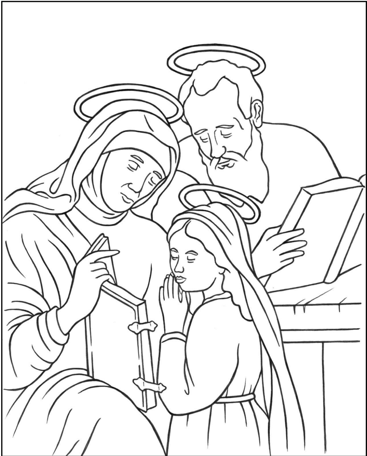
Saint Joachim, Saint Anne & Saint Mary