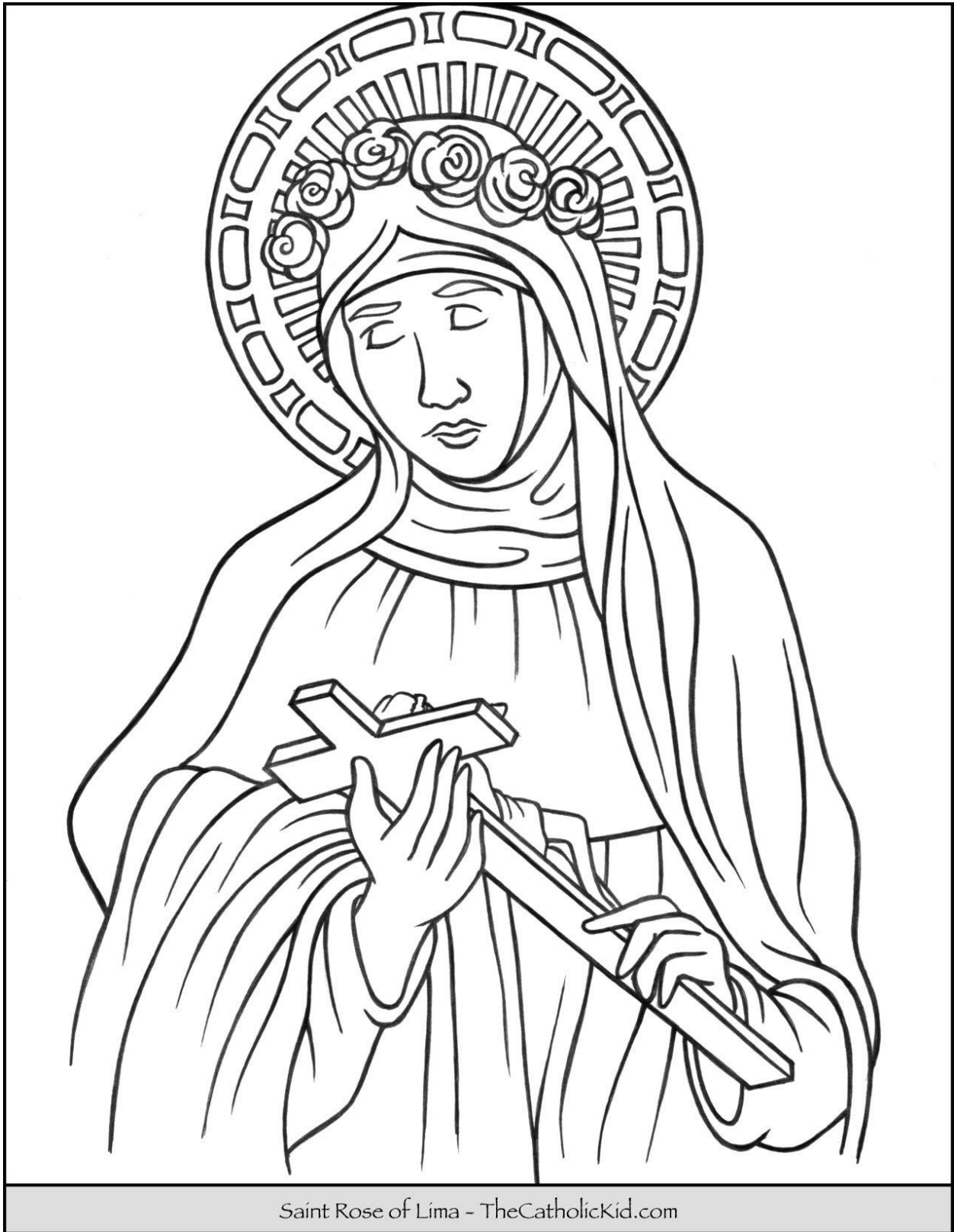
Saint Rose of Lima - TheCatholicKid.com

Brought to you by CatholicMom.com and Holy Cross Family Ministries. THE FAMILY THAT PRAYS TOGETHER STAYS TOGETHER.