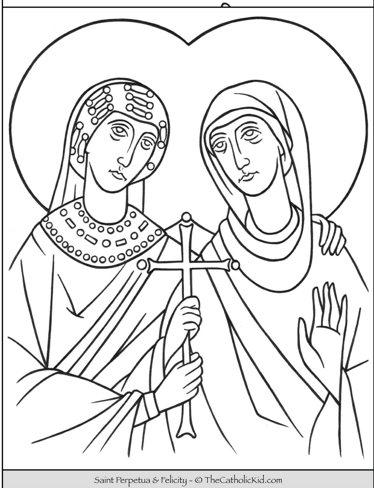
Saint Perpetua & Felicity

Brought to you by CatholicMom.com and Holy Cross Family Ministries. THE FAMILY THAT PRAYS TOGETHER STAYS TOGETHER.