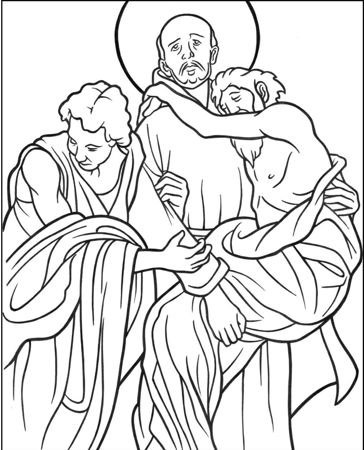
Saint John of God

Brought to you by CatholicMom.com and Holy Cross Family Ministries. THE FAMILY THAT PRAYS TOGETHER STAYS TOGETHER.