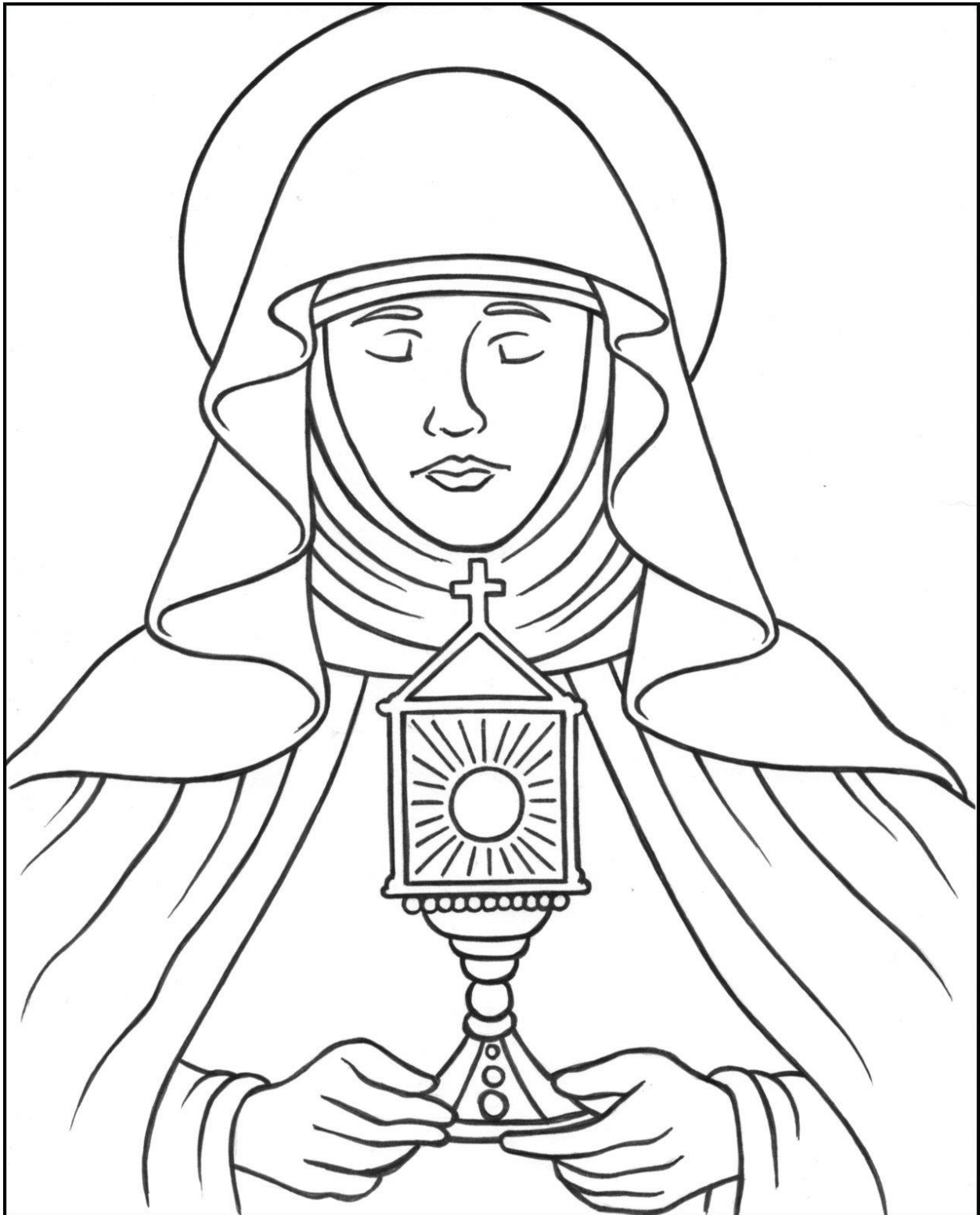
Saint Clare - TheCatholicKid.com

Brought to you by CatholicMom.com and Holy Cross Family Ministries. THE FAMILY THAT PRAYS TOGETHER STAYS TOGETHER.