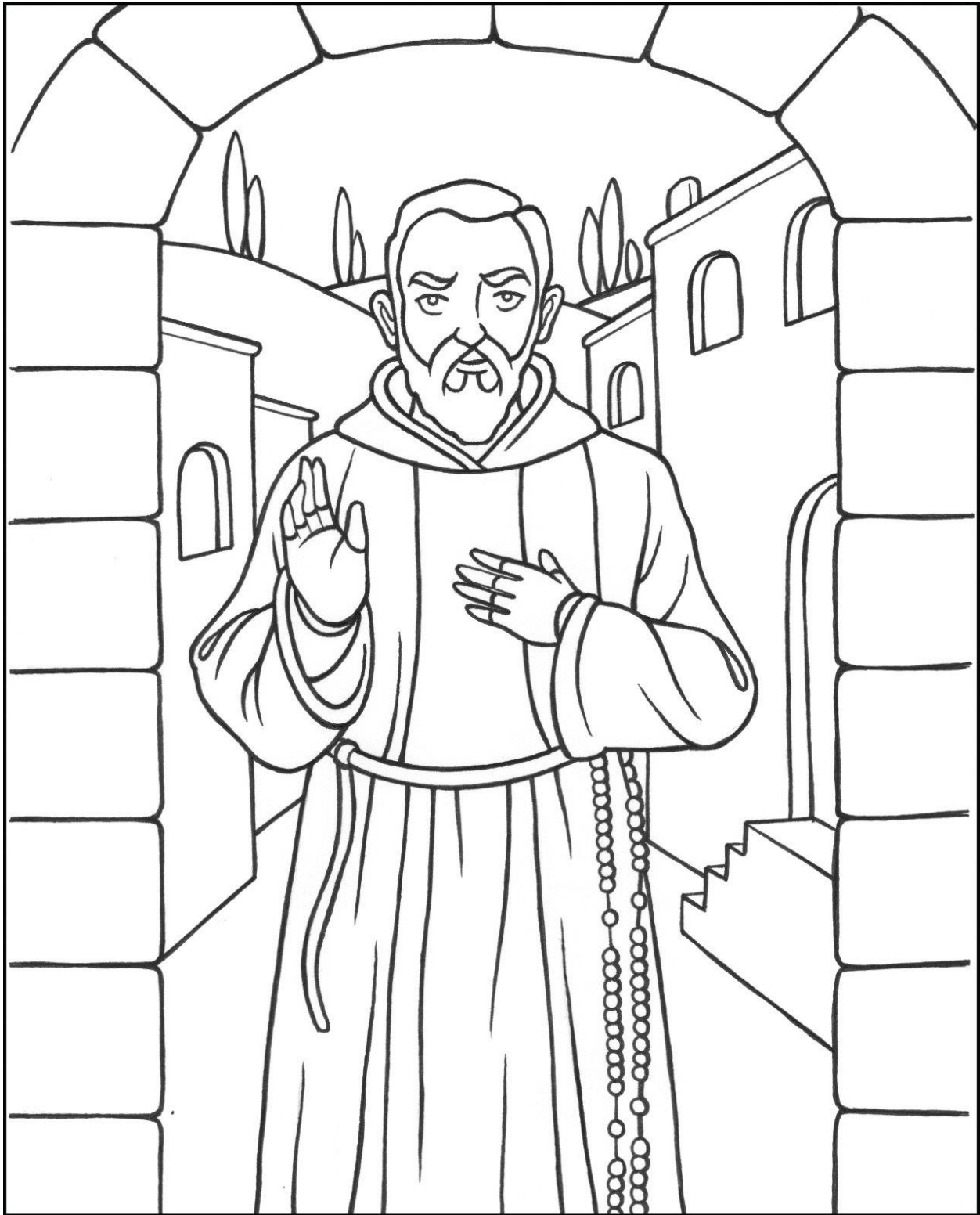
St. Padre Pio

Brought to you by CatholicMom.com and Holy Cross Family Ministries. THE FAMILY THAT PRAYS TOGETHER STAYS TOGETHER.