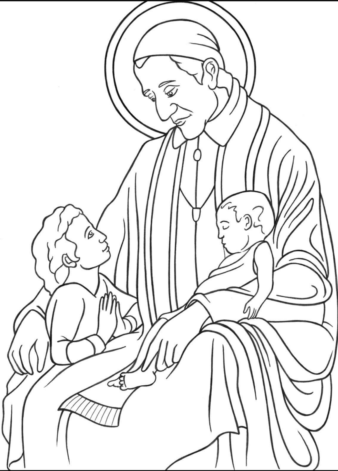
Saint Vincent de Paul

Brought to you by CatholicMom.com and Holy Cross Family Ministries. THE FAMILY THAT PRAYS TOGETHER STAYS TOGETHER.