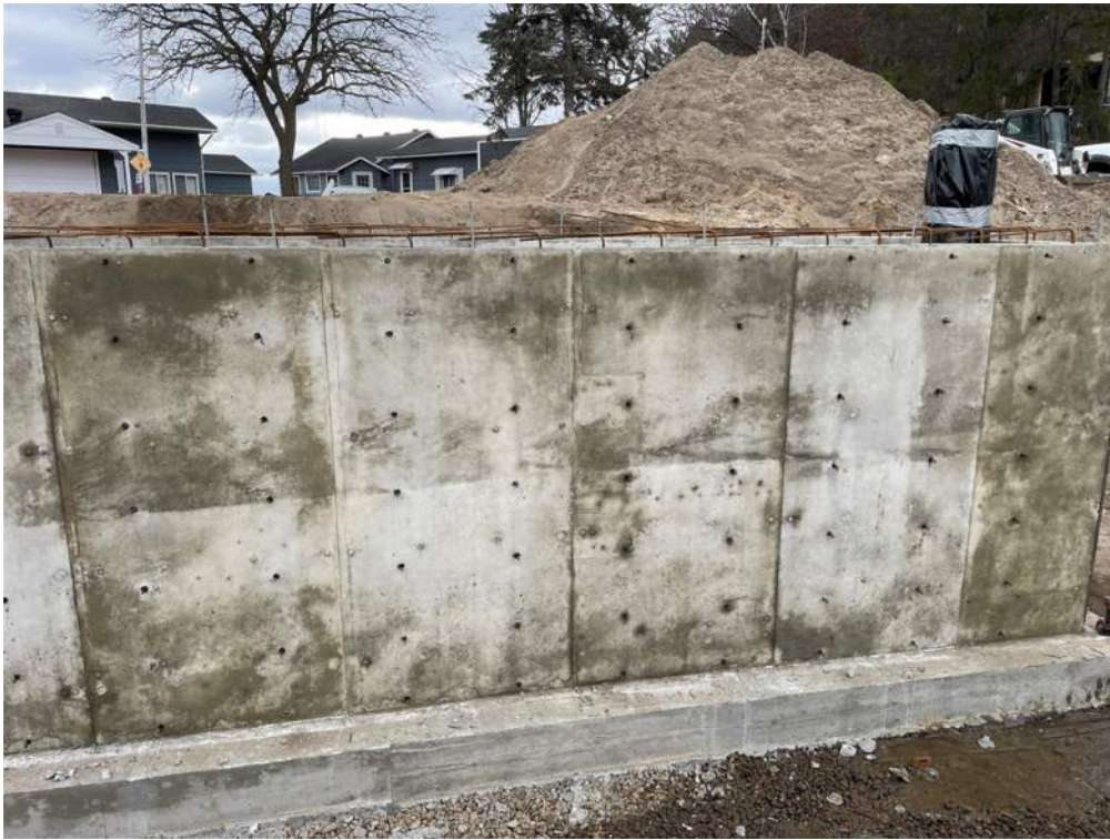
Photo #6: Foundation walls set for the pump house - Feb 23, 2024, 9:26 AM