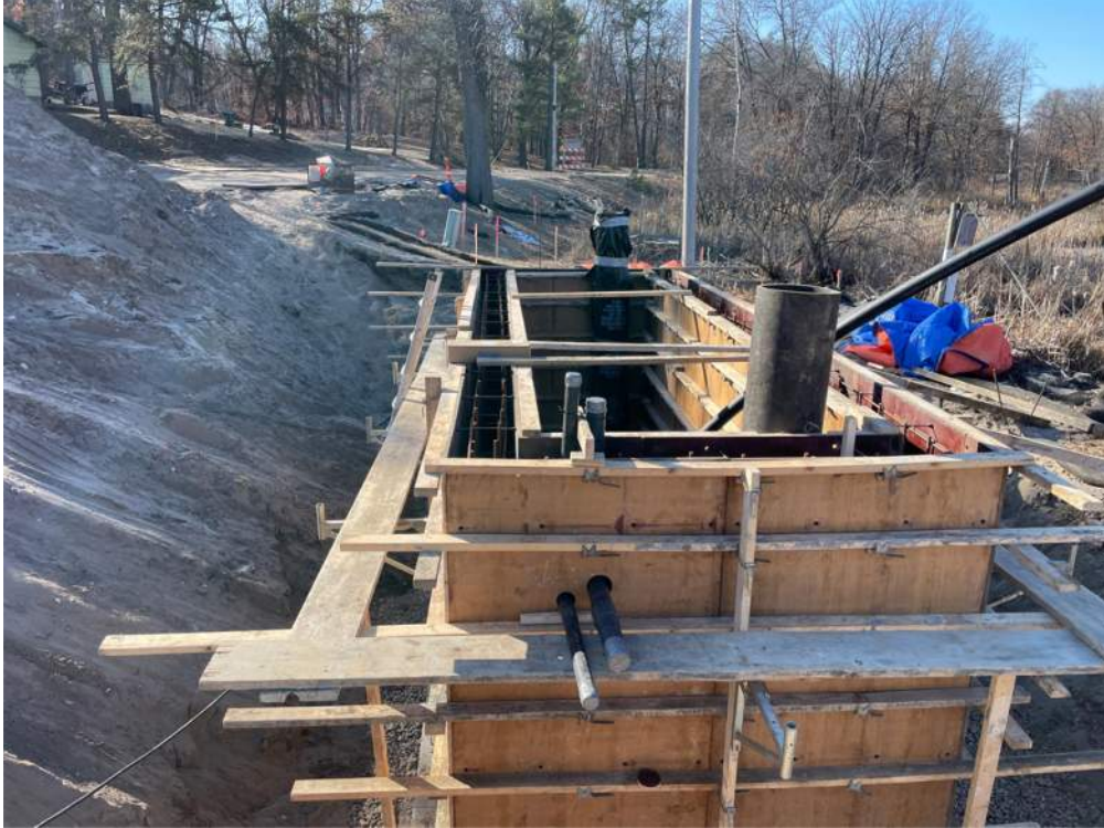
Photo #2: Forms and rebar set and ready to be poured for the concrete foundation walls of the pump station - Feb 20, 2024, 10:46 AM