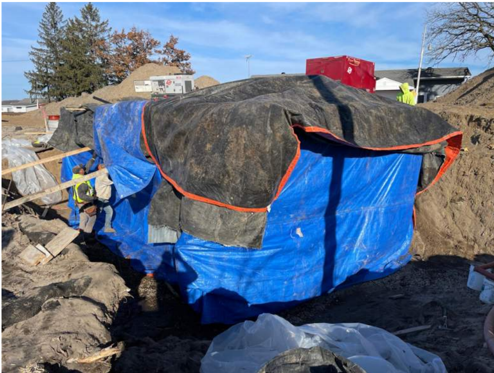
Photo #5: Concrete and forms all wrapped in concrete curing blankets to keep the heat inside - Feb 20, 2024, 3:29 PM