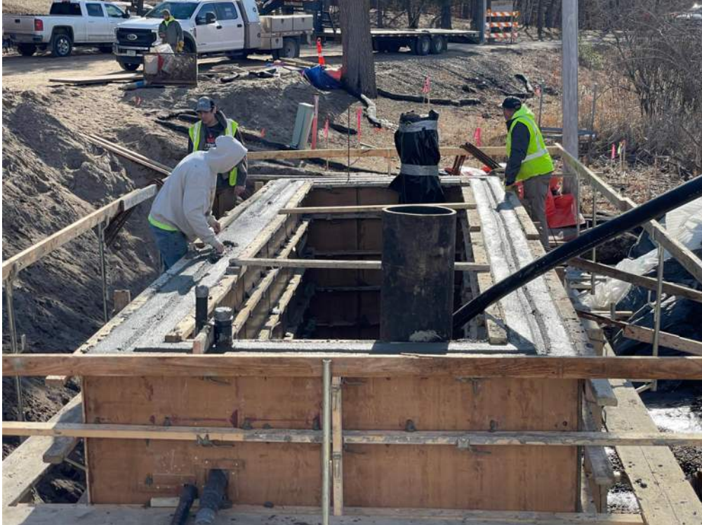
Photo #4: Hand forming in keyway into the top of the foundation walls - Feb 20, 2024, 2:05 PM