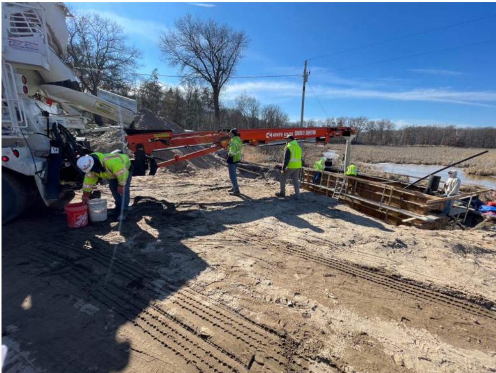
Photo #3: Conveying concrete into the forms for the foundation walls for the pump house - Feb 20, 2024, 12:59 PM