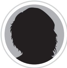
Melinda K. Cox (no photo provided)

JULIA STUBLE Q4: 1) Pragmatic and values-based budgeting 2) Expanding revenue sources 3) Investing in the future. We all want Lander to be a place where we can find jobs, where our parents can retire, and where our kids can play safely. Working together, we can build on what we already have going for us and create the community we want.