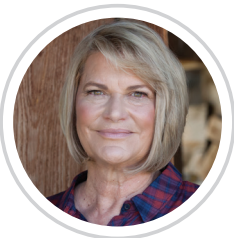
Cynthia M. Lummis