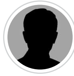
Brett Watson (no photo provided)