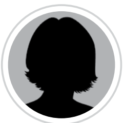
Cherry Plaisted (no photo provided)