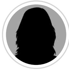
Emily Jarvis (no photo provided)