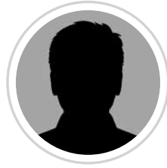
Dan Hahn (no photo provided)

QUESTION 1: What are two attributes and two qualifications that make you ready for this office?