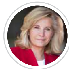
REPUBLICAN Liz Cheney