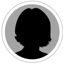
Kathleen Averil (no photo provided)