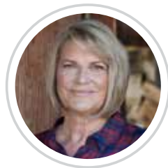
REPUBLICAN Cynthia M. Lummis

QUESTION 1: What is the appropriate balance between state and federal oversight of natural resources and lands in Wyoming? Why?