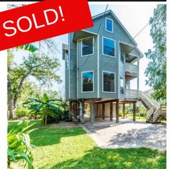
131 PINE ROAD SOLD - Alex Lyon

"We are CLS residents, we are CLS specialists"