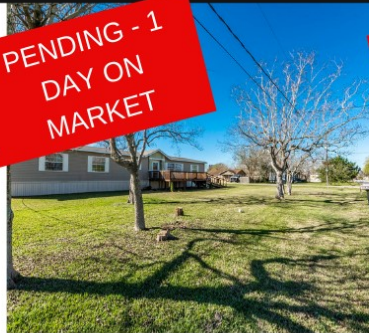
4702 18th STREET PENDING - Ellie Grant