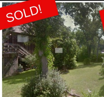
PINE ROAD - LOT SOLD - Alex Lyon