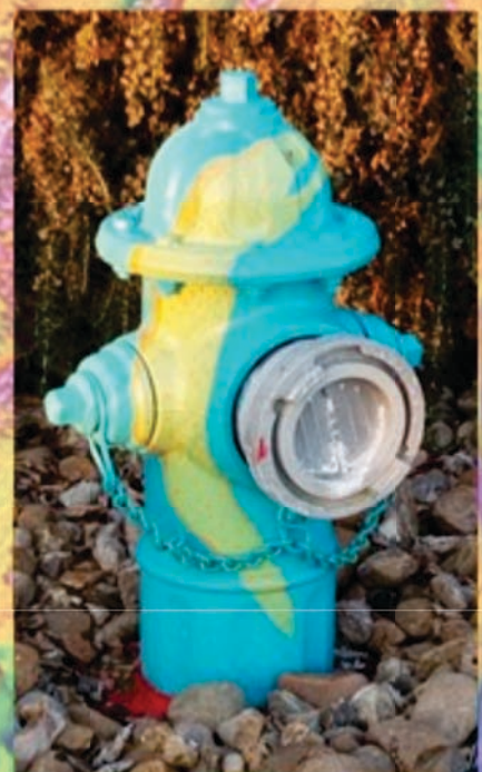
Robin Husband South Shore & Oak