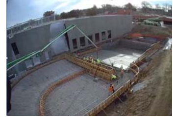
Swimming Pool Merriam Community Center Merriam, KS

U.S. Capital Brinkmann Constructors Fenix Construction Co. Penny's Concrete, Inc.