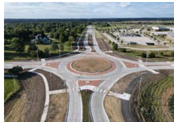
Municipal Paving Quivira Road - 159 th to 179 th St. Overland Park, KS

George J. Shaw Construction Co. Fordyce Concrete Co.