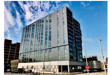
Multi-Family Reverb Kansas City, MO

Oddo Development Sharhag Architects Needham DBS Steller Concrete, LLC Penny's Concrete, Inc.