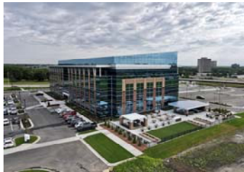
Low Rise CityPlace Corporate Centre I Overland Park, KS

Johnson County Wastewater McCarthy Building Companies McCarthy Castle Joint Venture Black & Veatch Penny's Concrete, Inc.