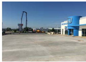
Conversion to Concrete Dale Willey Honda Parking Lot Lawrence, KS

City of Olathe, KS Titan Built SFS Architecture Inc. Bedrock Concrete, LLC Geiger Ready-Mix Co., Inc.