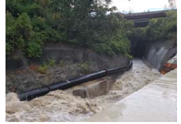
Municipal Projects Turkey Creek MO Interceptor Kansas City, KS

Bedworth Family Bakken Construction Show Me Ready Mix