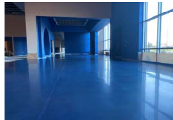
Polished Concrete Project Bobo Lenexa, KS

City of Overland Park, KS Olsson Associates Miles Excavating Geiger Ready-Mix Co., Inc.