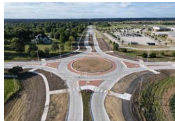
Municipal Paving Quivira Road - 159 th to 170 th St. Overland Park, KS

George J. Shaw Construction Co. Fordyce Concrete Co.