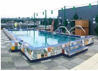
Concrete Renovation City Club Apartments Kansas City, MO

CCA Crossroads MW Builders BKV Group Odeh Engineers Summit Concrete Penny's Concrete, Inc.