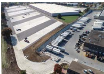
Parking Lot UPS Lenexa, KS

Leavenworth Waterworks Layne Christensen Co. Black & Veatch Geiger Ready-Mix Co., Inc.