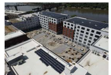
Sustainability/Resiliency Second + Delaware Apartments Kansas City, MO

Dale Willey Honda Hunt Inc. Paul Werner Architects Concrete Unlimited Construction Midwest Concrete Materials, Inc.