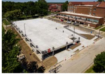
Parking Garage Donnelly College Parking Garage Kansas City, KS

CCA Crossroads MW Builders BKV Group Odeh Engineers Summit Concrete Penny's Concrete, Inc.