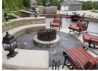
Decorative Residential Bedworth Residence Buckner, MO

Donnelly College Excel Constructors Burns & McDonnell Lithko Contracting, LLC Talon Concrete