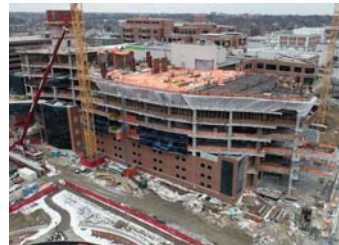
High Rise Children's Mercy Research Tower Kansas City, MO

CityPlace Corporate Centre I Titan Built Bedrock Concrete, LLC Geiger Ready-Mix Co., Inc.