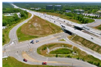
Paving DOT I-435 South Loop Kansas City, MO

doorLink Manufacturing, Inc. Miller-Stauch Construction Co. Concrete Strategies Geiger Ready-Mix Co., Inc.