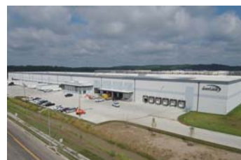
Site Cast Tilt-Up doorLink Riverside, MO

18 th & Walnut Partners Burns & McDonnell Ceco Concrete Construction Talon Concrete