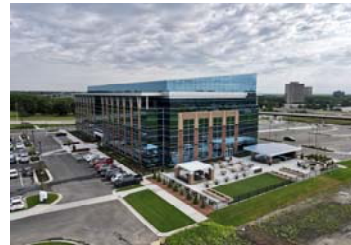
Low Rise CityPlace Corporate Centre I Overland Park, KS

Johnson County Wastewater McCarthy Building Companies McCarthy Castle Joint Venture Black & Veatch Penny's Concrete, Inc.