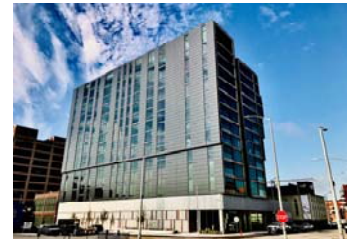
Multi-Family Reverb Kansas City, MO

Oddo Development Sharhag Architects Needham DBS Steller Concrete, LLC Penny's Concrete, Inc.