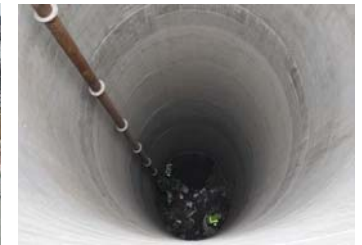
Technology/Innovation Leavenworth Waterworks South Well Field Leavenworth, KS

Children's Mercy Hospital McCownGordon Bob D. Campbell & Co. BSA Life Structures George J. Shaw Construction Co. Talon Concrete