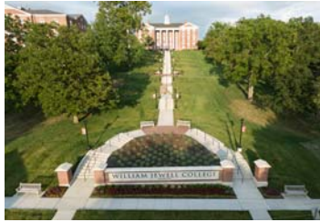
Commercial Flatwork William Jewell Stairs Liberty, MO

Loews Hotel J.E. Dunn Construction Co. Cooper Carry WSP USA Musselman & Hall Contractors LLC Talon Concrete Fordyce Concrete Co.