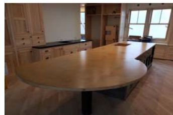
Countertops/Furniture Lee Residence Lake Lotawana, MO

Missouri Dept. of Transportation Wilson & Company Radmacher Brothers Excavating Penny's Concrete, Inc.