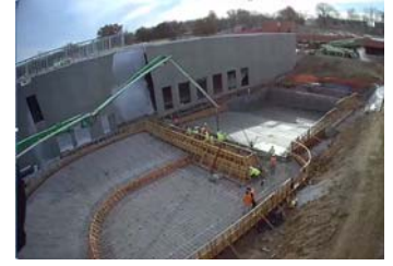
Swimming Pool Merriam Community Center Merriam, KS

U.S. Capital Brinkmann Constructors Fenix Construction Co. Penny's Concrete, Inc.