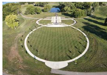
Parks & Rec. Lake Olathe Park - Phase 1 Olathe, KS

UPS McCownGordon George J. Shaw Construction Co. Davidson Architecture + Engineers Talon Concrete