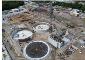
Wastewater Tomahawk Creek Wastewater Treatment Facility Leawood, KS

Unified Govt. of Wyandotte County U.S. Army Corps of Engineers Phillips Hardy Inc. Geiger Ready-Mix Co., Inc.