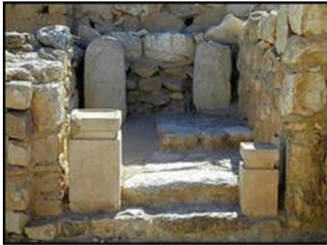
High places of ancient Israeli city of Arad

casting down arguments: The word argument or imaginations in Greek is Logismos , which means logic, reasoning, or understanding. We are to pull down false ways of thinking, or false reasoning. This covers a very broad spectrum on both small and large scales. Many of our “isms” are essentially spiritual strongholds of false reasoning. Take your pick, Communism, Hinduism, Alcoholism, Atheism, Racism, and more, are all forms of logic which make sense to the people entrapped. We are called to cast down or destroy this false logic.