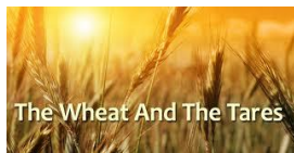
The Wheat And The Tares

Man is pictured as wheat, grain, and weeds. The righteous are referred to as the harvest of edible useful grain while the lost are viewed as chaff and weeds. A sickle is an instrument used to reap the harvest. Jesus referred to this future harvest in the parable of the wheat and tares. In this parable, Jesus explained that at the end of the age the tares would be gathered to be burned. The harvest is only at the right time, because if harvested too early wheat may be lost.