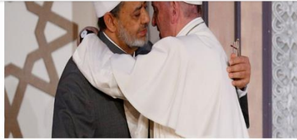
Pope Francis embraces Sheikh Ahmad al-Tayeb, grand imam of al-Azhar University, at a conference on international peace in Cairo April 28. The pope was making a two-day visit to Egypt.

These are photos showing Pope John Paul II entering a mosque and kissing the Koran. One of Pope John Paul's closest friends was the Dali Lama who was the world leader of eastern and “new age” paganism.