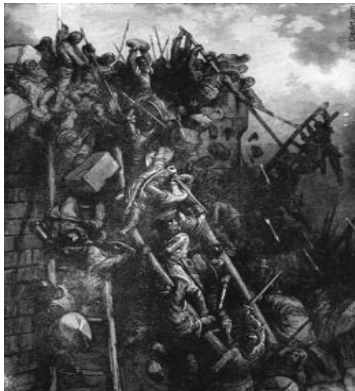
Soldiers of the First Crusade Storming Antioch

The weapons of our warfare are the Sword of the Spirit (which is the word of God) and Prayer. With this double-edged sword, we have the ability to tear down any stronghold. We need to learn to take God at His Word, for this weapon of our warfare is more powerful than anything the world can ever offer.