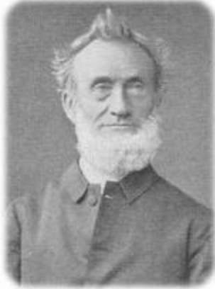
George Mueller 1805-1898

They were off the coast of Newfoundland when the weather turned cold and the ship's progress was seriously retarded by fog. The captain had been on the bridge for 24 hours when something happened which was to revolutionize his life. George Mueller appeared on the bridge.