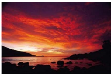
Spiritual warfare is a battle between for the souls of lost humanity.

Matthew 21:20-22 "20 And when the disciples saw it, they marveled, saying, 'How did the fig tree wither away so soon?' 21 So Jesus answered and said to them, 'Assuredly, I say to you, if you have faith and do not doubt, you will not only do what was done to the fig tree, but also if you say to this mountain, 'Be removed and be cast into the sea,' it will be done. 22 'And whatever things you ask in prayer, believing, you will receive.'"