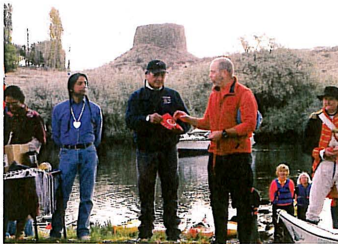
Northwest Discovery Water Trail: ID, WA, OR. A year-long celebration of dedication events is launching the Northwest Discovery Water Trail, a 367-mile water route through three states. Here, at Hat Rock State Park, The Confederated Tribes of the Umatilla Indian Reservation present peace medals to the Water Trail Steering Committee at a "Trace the Trail" Lewis & Clark Bicentennial event. RTCA is helping with public outreach and development of a trail management plan.

A network of 70 community-based planning professionals delivers the RTCA Program nationwide, helping communities to help themselves achieve on-the-ground success. Through RTCA, the National Park Service offers conservation assistance to communities in every state.