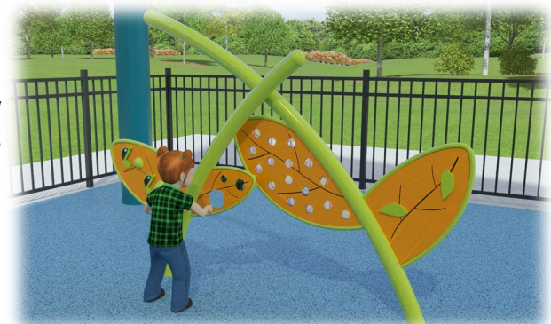
Leaf Activity Panel: $10,450