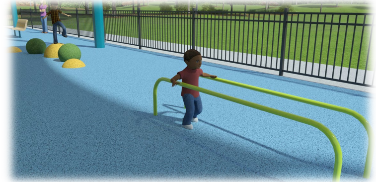
Parallel Bars: $1,390

Parallel Bars are set low to the ground at an appropriate height for small children. They provide an opportunity to practice standing upright on their own or with friends in a safe and supported way. Children who don't require support enjoy following the path, and wheelchair users can pull themselves alongside their friend.