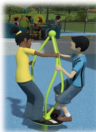
Curva Spinner: $2,535