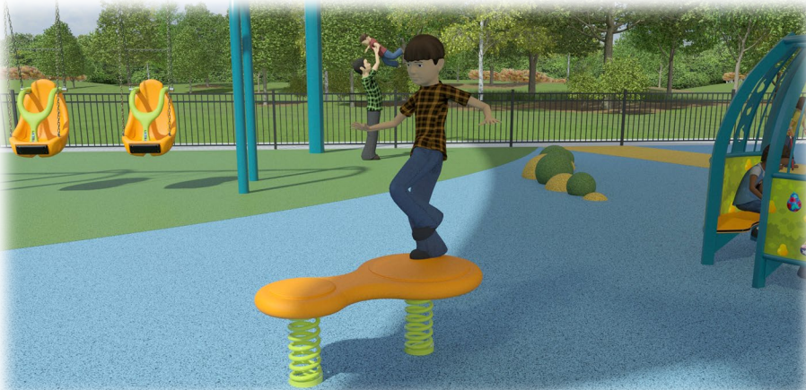
Wobble Pod: $2,080

Half and Full Ball Pods allow children to work on leg stability and strength with varying elevation change and levels of challenge. We have provided two different types of climbing experiences for 2-5 year olds so they can learn to master gravity while they play. The tactile surface allows their feet to grip the surface safely. For the climbing experience the balls are touching so children don't accidentally fall in between each. For the stepping experience they are separated by 10-12 inches for a true stepping challenge with varying difficulty. Both of these activities invite children to use their vestibular system to balance and gain awareness of their own body.