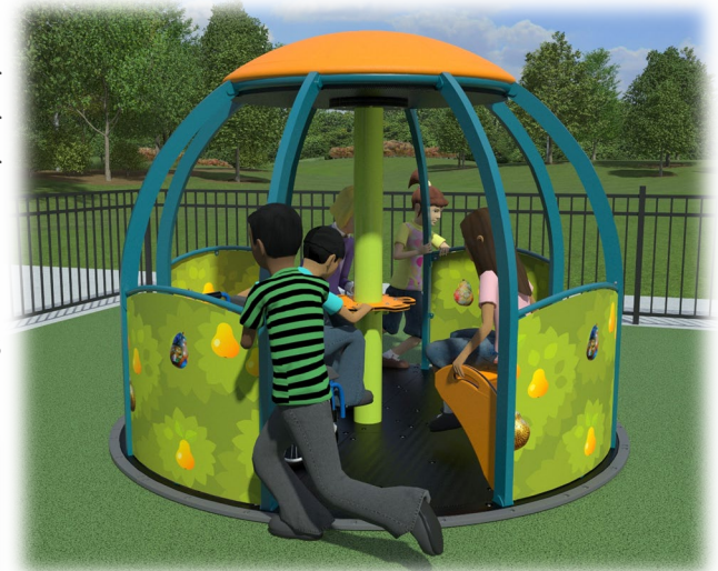
We-Go Round: $43,510

Total Donation: $60,460 (Equipment) $27,265 (Resilient Surfacing)