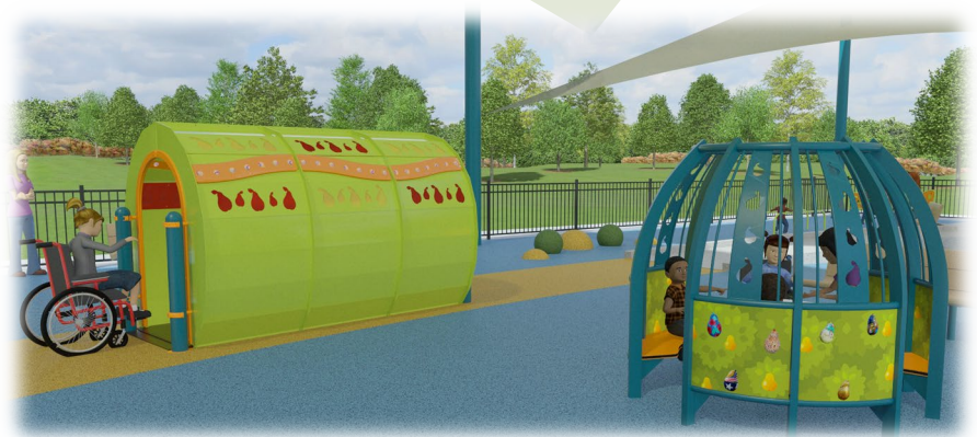
Sensory Tunnel: $39,540

Total Donation: $85,040 (Equipment) $18,860 (Resilient Surfacing)