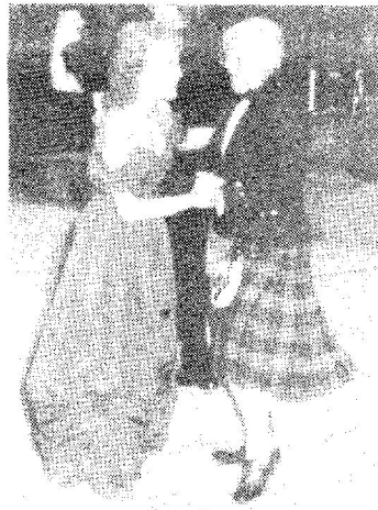
And he can dance...