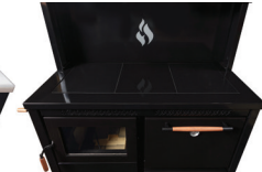
3 Panel Porcelain Top