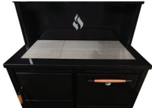
3 Panel Polished Steel Top

3 Panel Tops allow for the entire stove top (all three panels and the stovetop border) to be easily replaced. The Solid Polished Steel Tops are welded to the stove body.